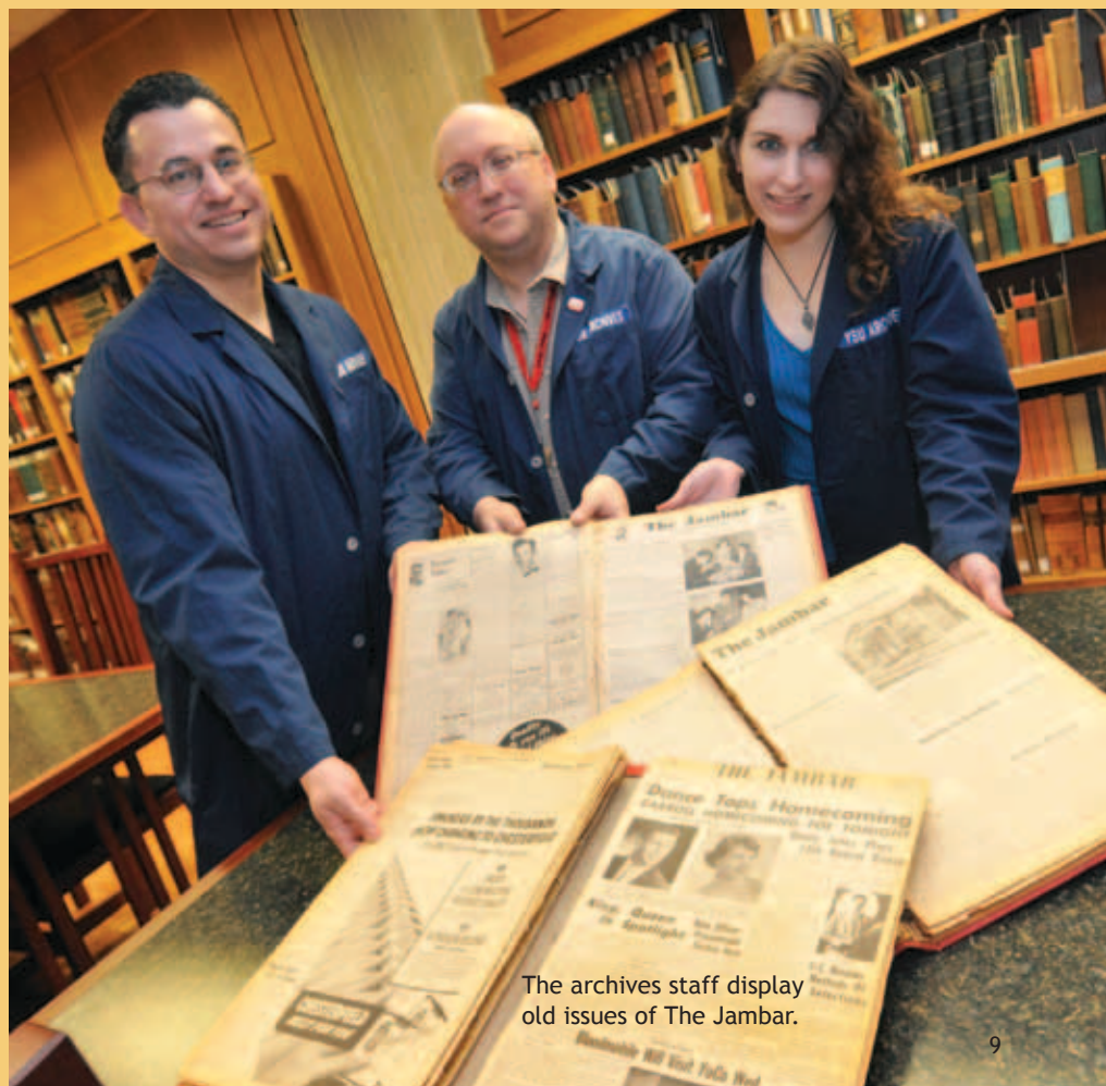
The archives staff display old issues of The Jambor.