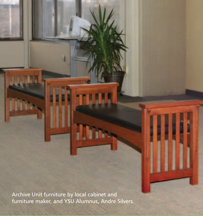
Archive Unit furniture by local cabinet and furniture maker, and YSU Alumnus, Andre Silvers.