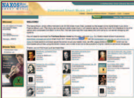
Naxos Sheet Music Database

Maag library staff began to utilize Wordpress weblogging software both to improve communications to our constituents and to provide a mechanism for managing web pages that require frequent updates by non-technical staff.