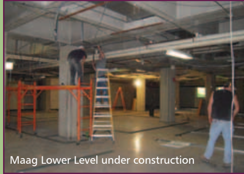
Maag Lower Level under construction

Maag Staff were active this year in partnering with Student Affairs in the SOAR programs and in greatly expanding Maag's Welcome Week activities.