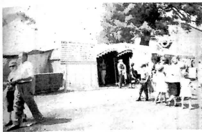
MEDICAL TENT 1958

2002 marks the 156 th year for the Canfield Fair. It also marks the 52 nd consecutive combined medical-health exhibit. The Canfield Fair ranks among the top in the nation in daily attendance; in 2001, 382,637 people passed through the Fair gates. In 1951, the Mahoning County Medical Society organized an exhibition at the Canfield Fair that included volunteer health agencies and members of the health professions. It was set up in a tent and the annual exhibit continues to this day. It is one of the outstanding non-commercial things the fair has to offer. Since 1971,