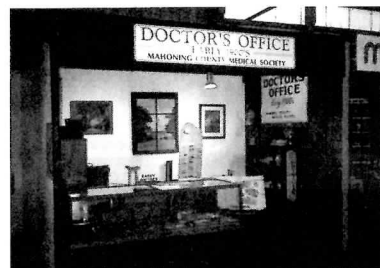
DOCTOR'S OFFICE CIRCA 1900

The Health and Medical Building is part museum and part health education. The medical office of the early 1900's showcases equipment and instruments used at that time.