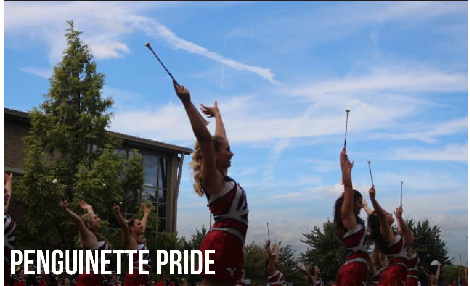
The Penguinettes look forward to a chance to stand out this semester.