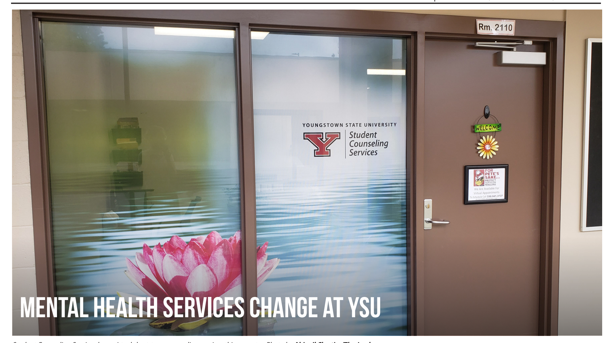
Student Counseling Services have virtual short-term counseling services this semester.