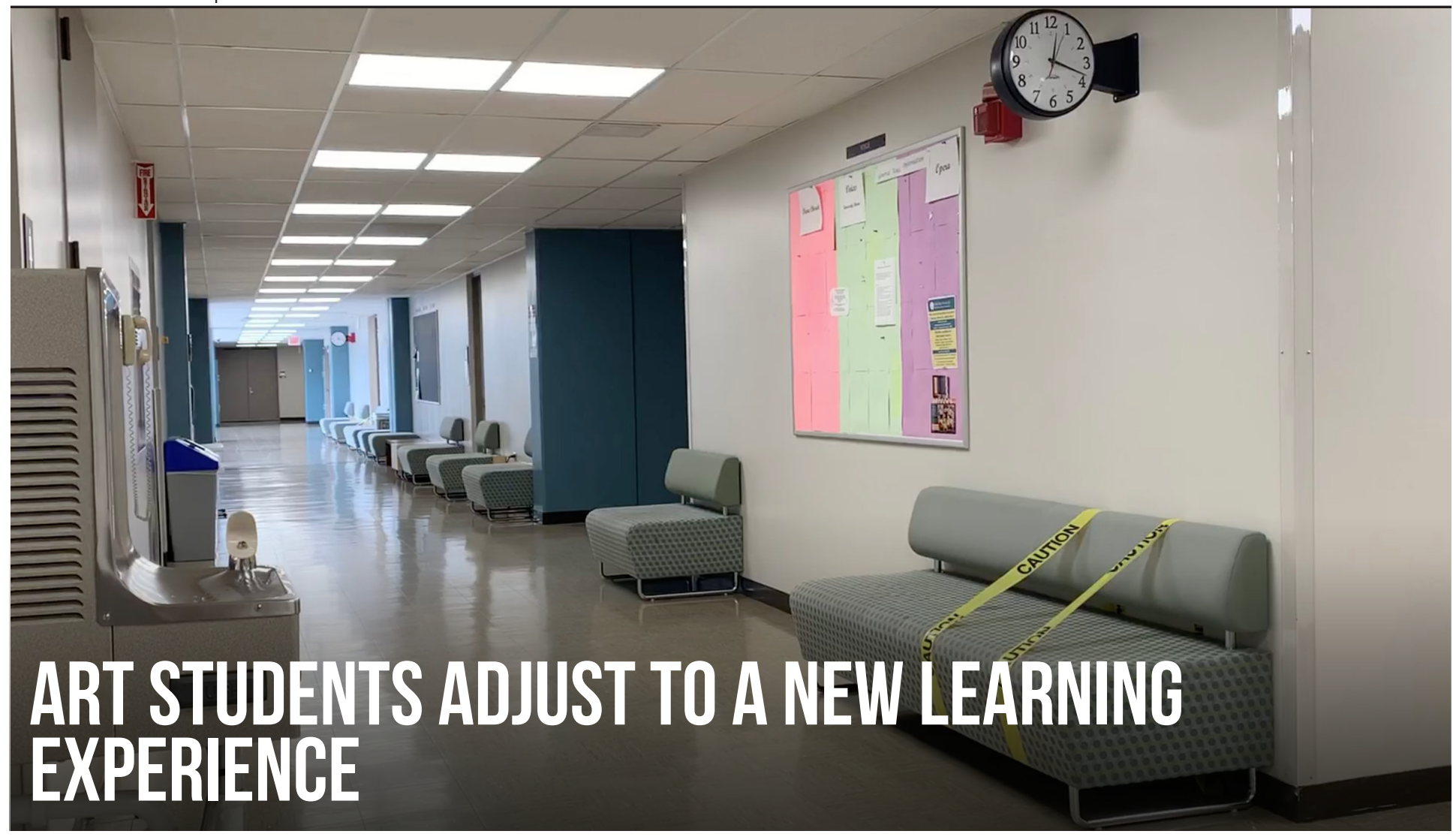
Art students continue creating despite COVID-19 restrictions.