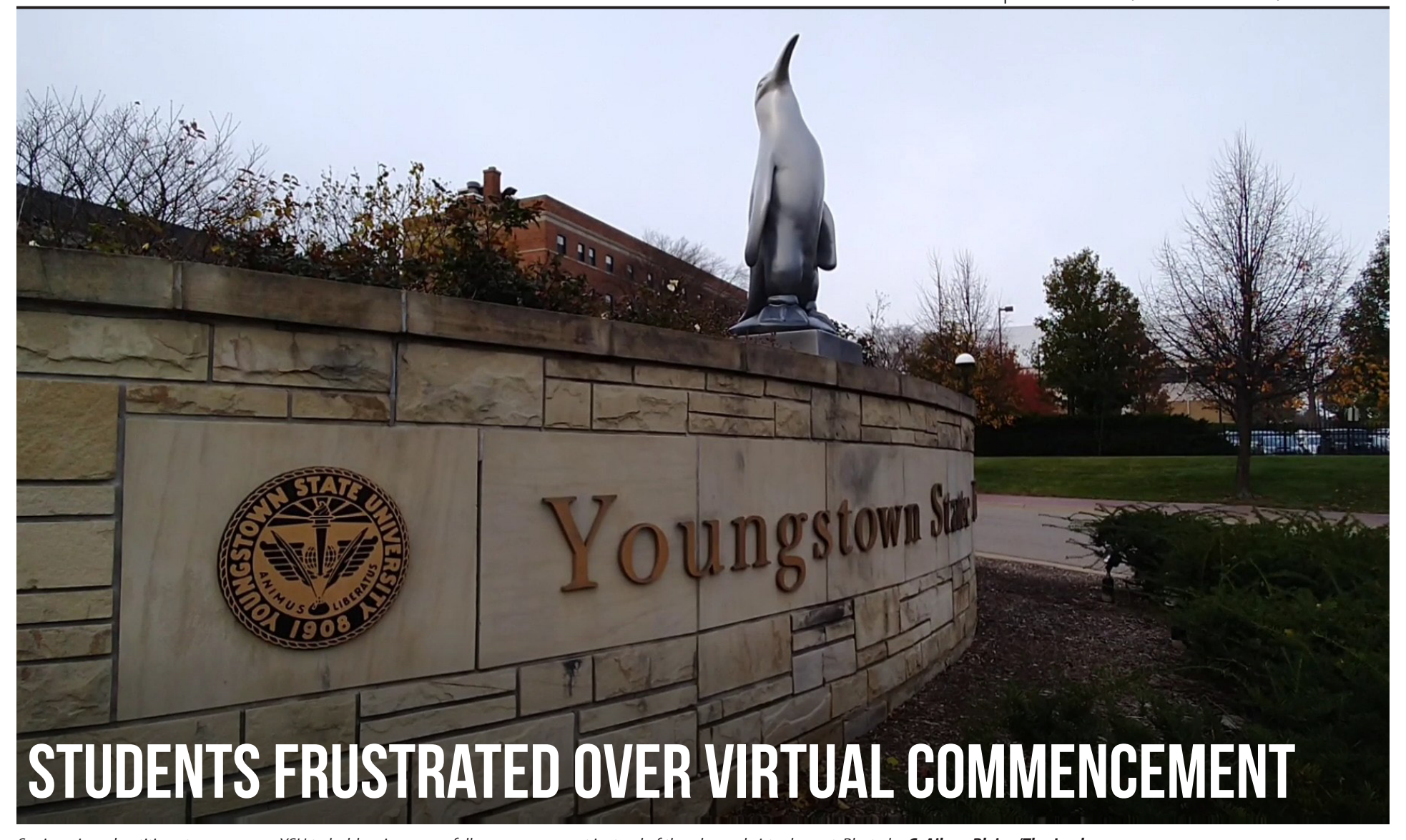
Seniors signed petitions to encourage YSU to hold an in-person fall commencement instead of the planned virtual event.