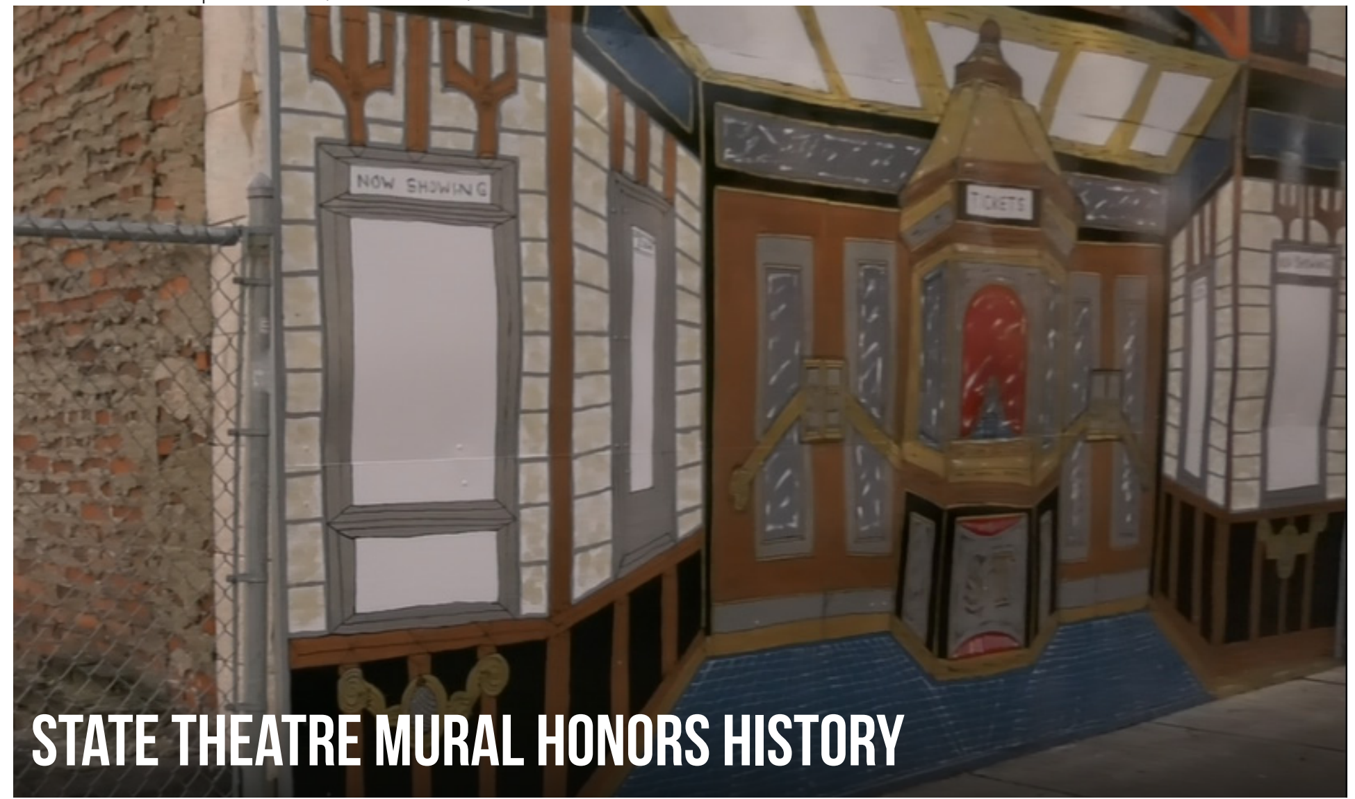
Bob Barko Jr. initiated the "State Theatre Block Project" to honor the history of the building demolished in 2008.