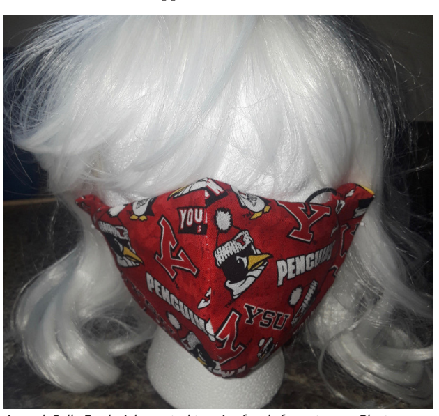
A mask Sally Frederick created to raise funds for veterans.

Jessica Neral, Samantha Neral and Frederick have used the new guidelines as an opportunity to make fashionable masks for good causes. Currently, they all still have masks for sale, available on the YSU app.