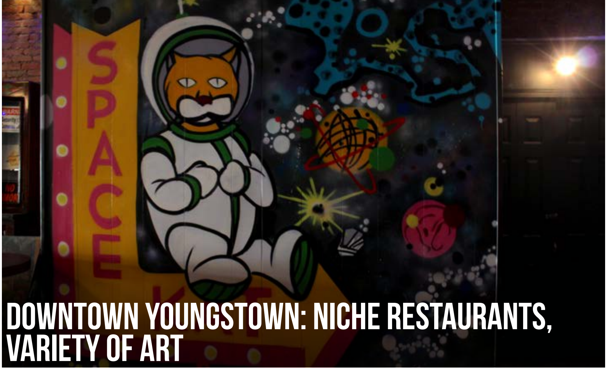
Space Kat Barbecue is one of many dining options downtown for students to check out.