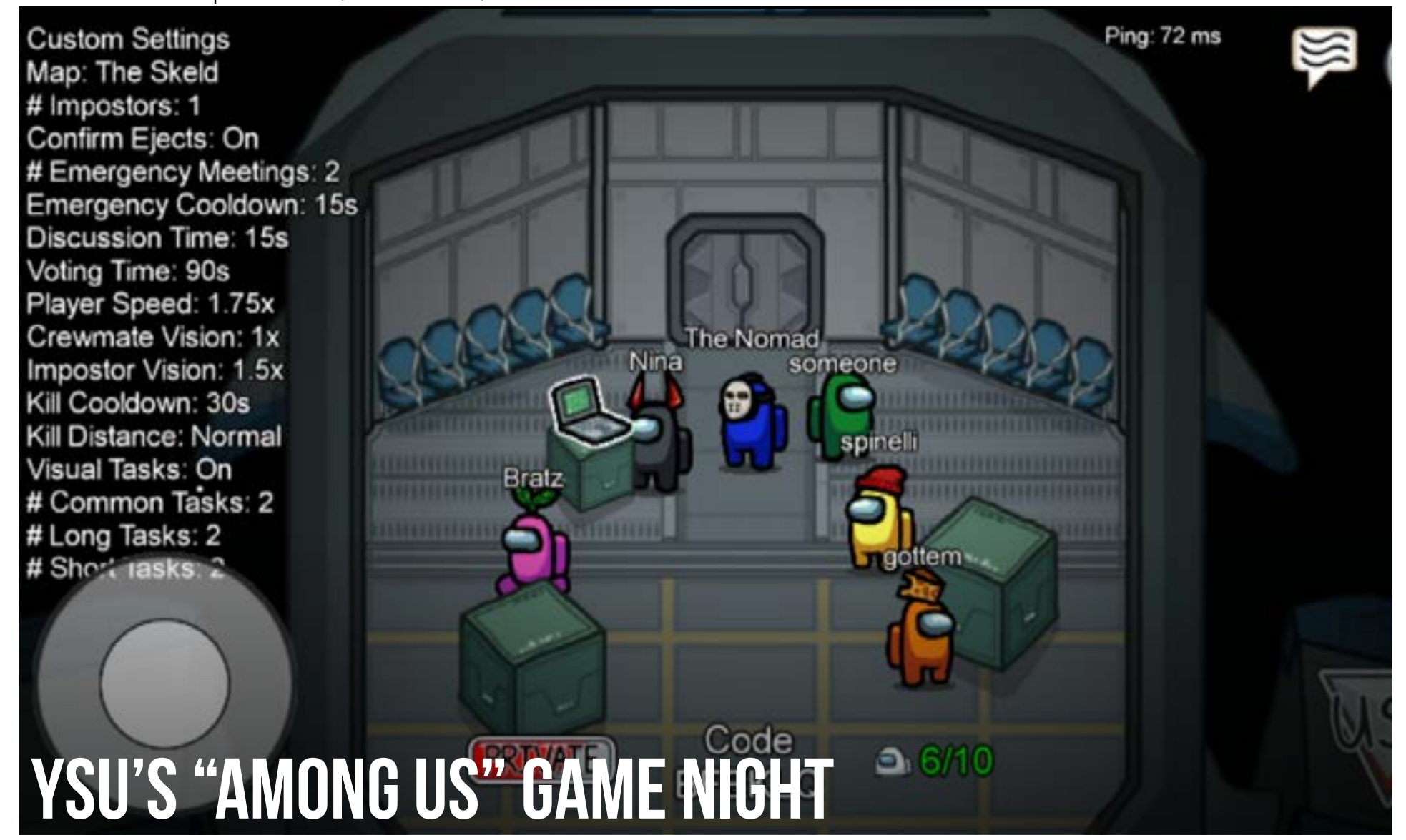
YSU students face off virtually in a game of "Among Us."