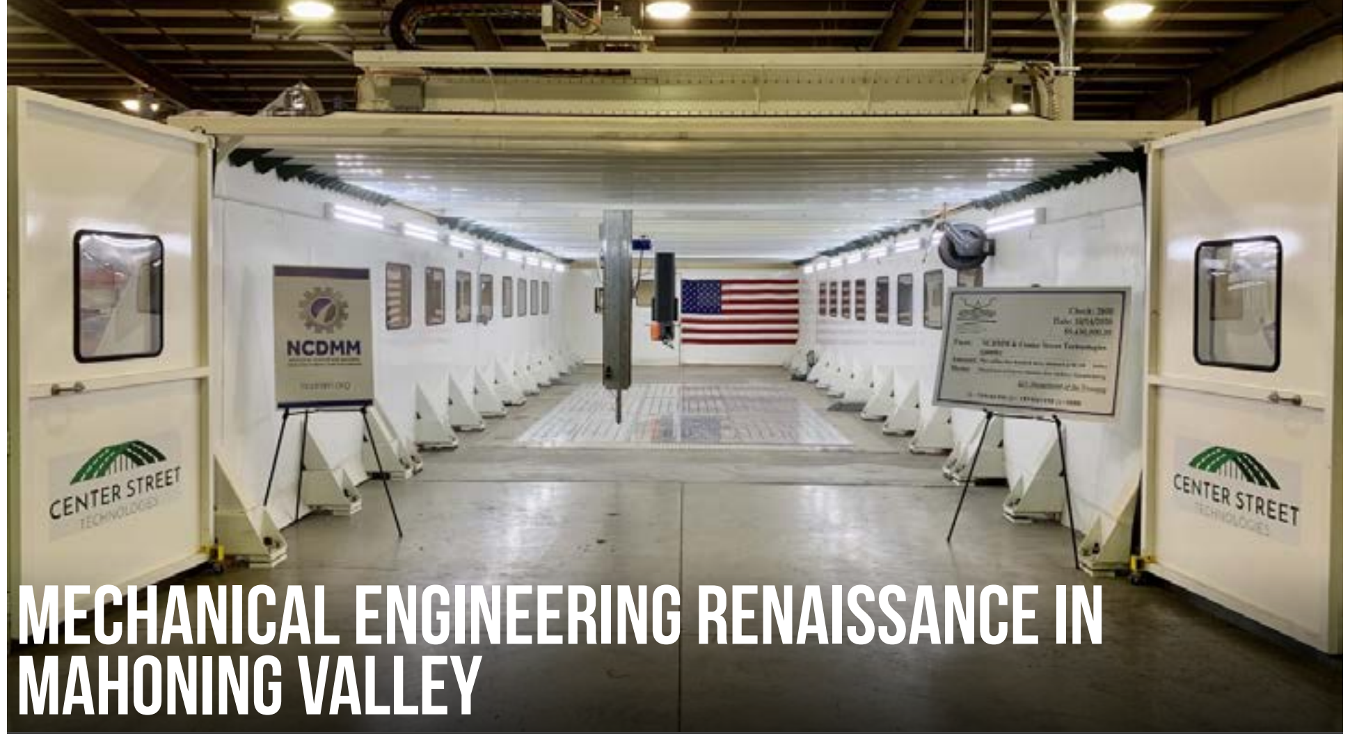
Center Street Technologies is an additive manufacturing company in the Youngstown area offering mechanical engineering opportunities to students.