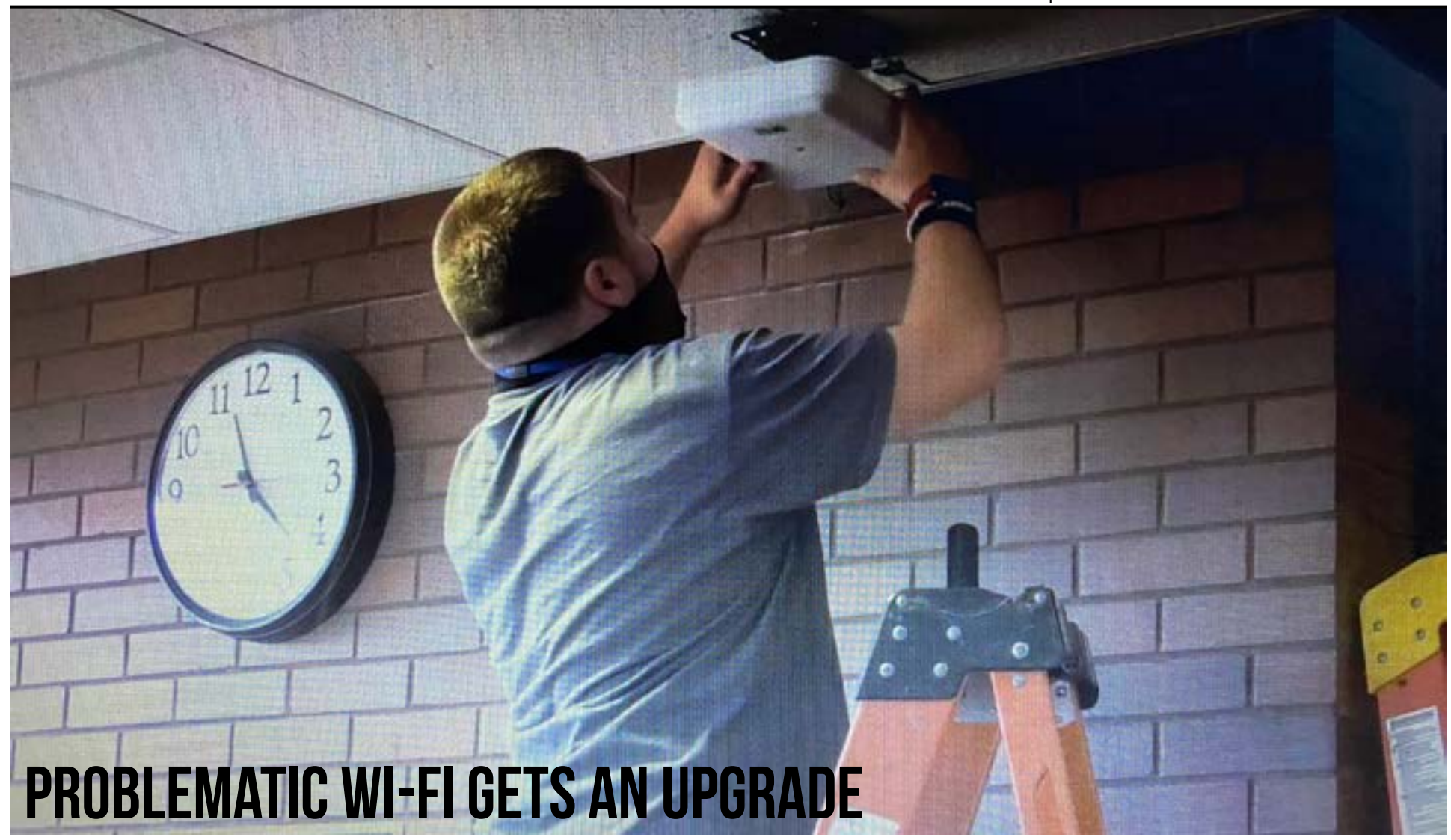
Newly installed Wi-Fi routers on campus will make the internet on campus faster and have increased coverage.