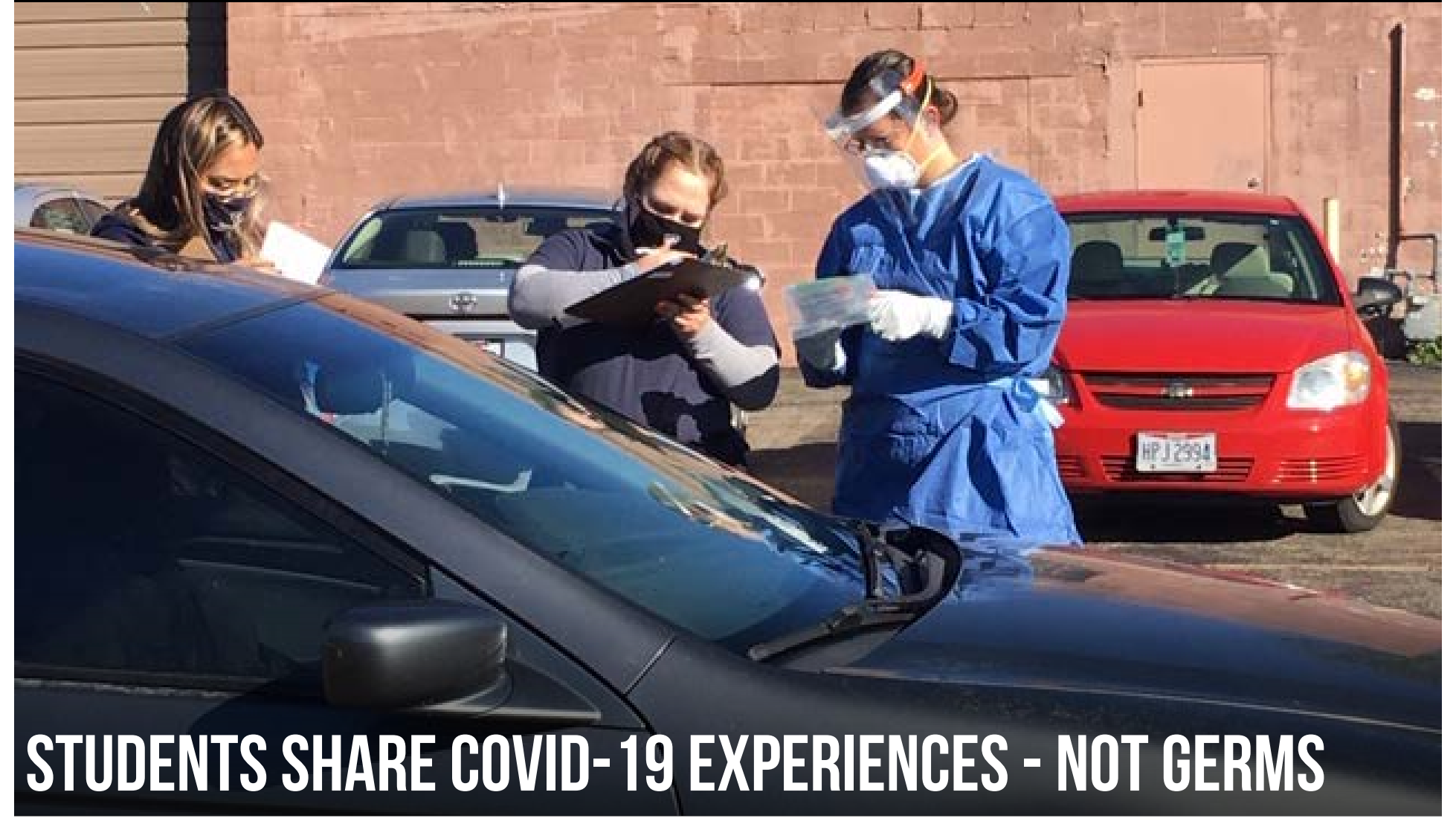
Health care professionals fill out forms and prepare to test for COVID-19 at a free drive-up event.