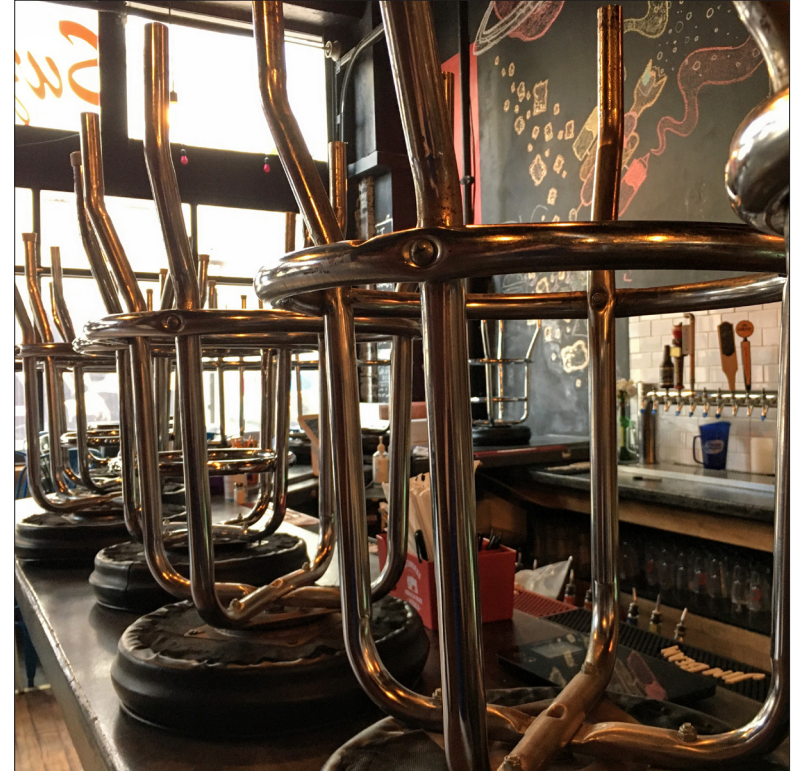
RIGHT: Barstools are stacked on top of the bar to limit seating inside Suzie's Dogs and Drafts.