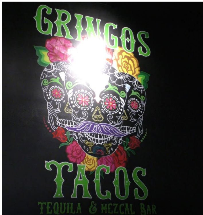
LEFT: Gringos Tacos opened during the COVID-19 pandemic.