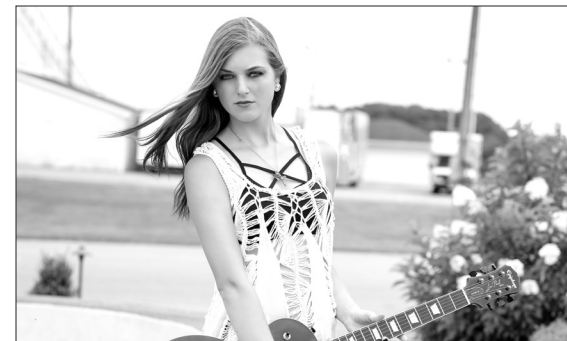
Campana's music is available on Spotify, Apple Music, ReverbNation and YouTube.

She doesn't just enjoy the sound of chugging guitars, rattling drums and the occasional bagpipe dirge. She also appreciates the complexity behind