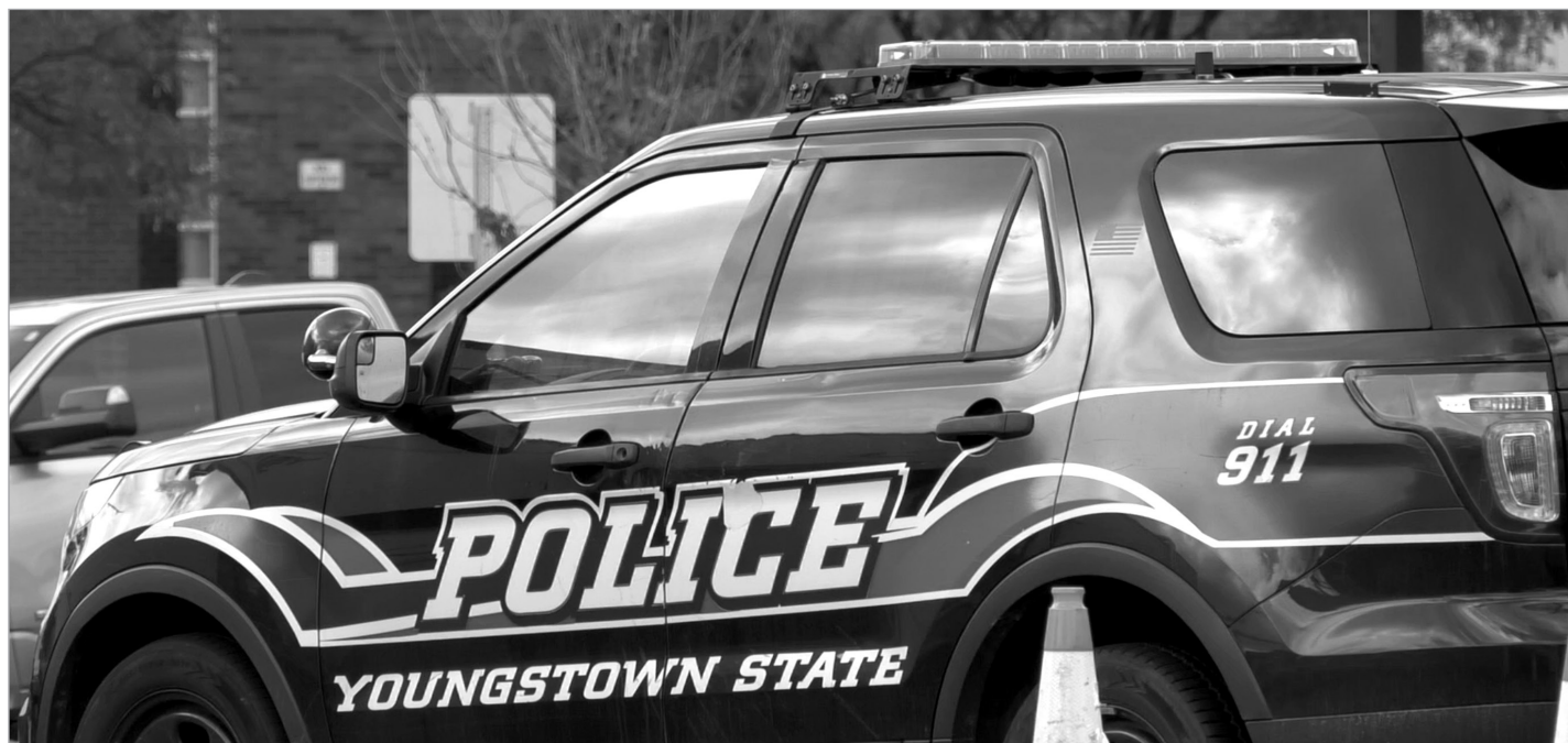
YSU police respond to a call from the university courtyards on Sept. 11.