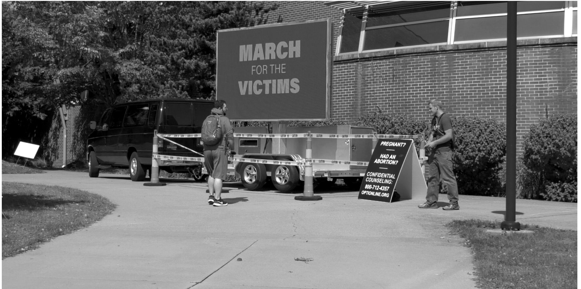
Anti-abortion protestors share their message.