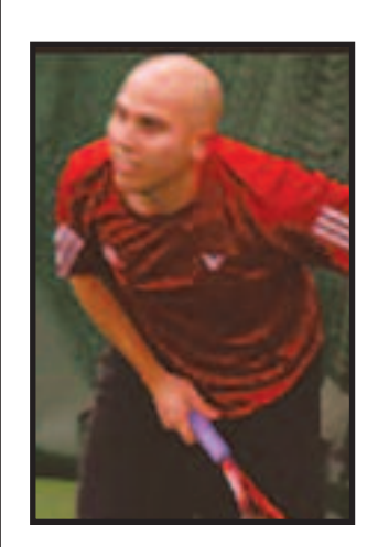
Consistency a must for tennis team's success on court See page 6