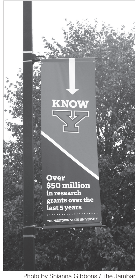
"Know Y" banners line Tressel Way.