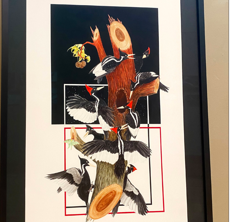
"Phantom Limb," (bottom right) is one of several paintings on display.