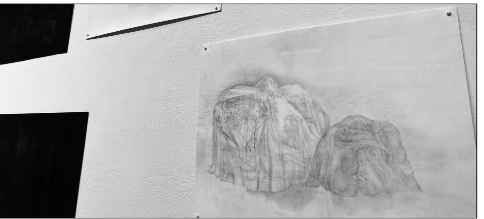
Shona Macdonald's collection is titled "Flash of Light Illumines a Dark Landscape."