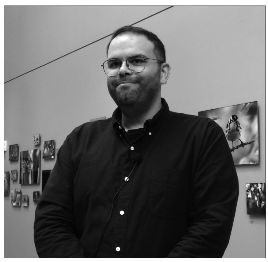
Petruzzi's exhibit will be on display at Fellows Riverside Gardens through Oct. 1.

For photography, Petruzzi has a separate Instagram @jgpbirds.