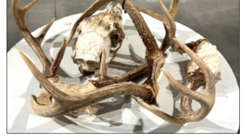
Betsy Stirrat's collection is titled "Embedded Histories."