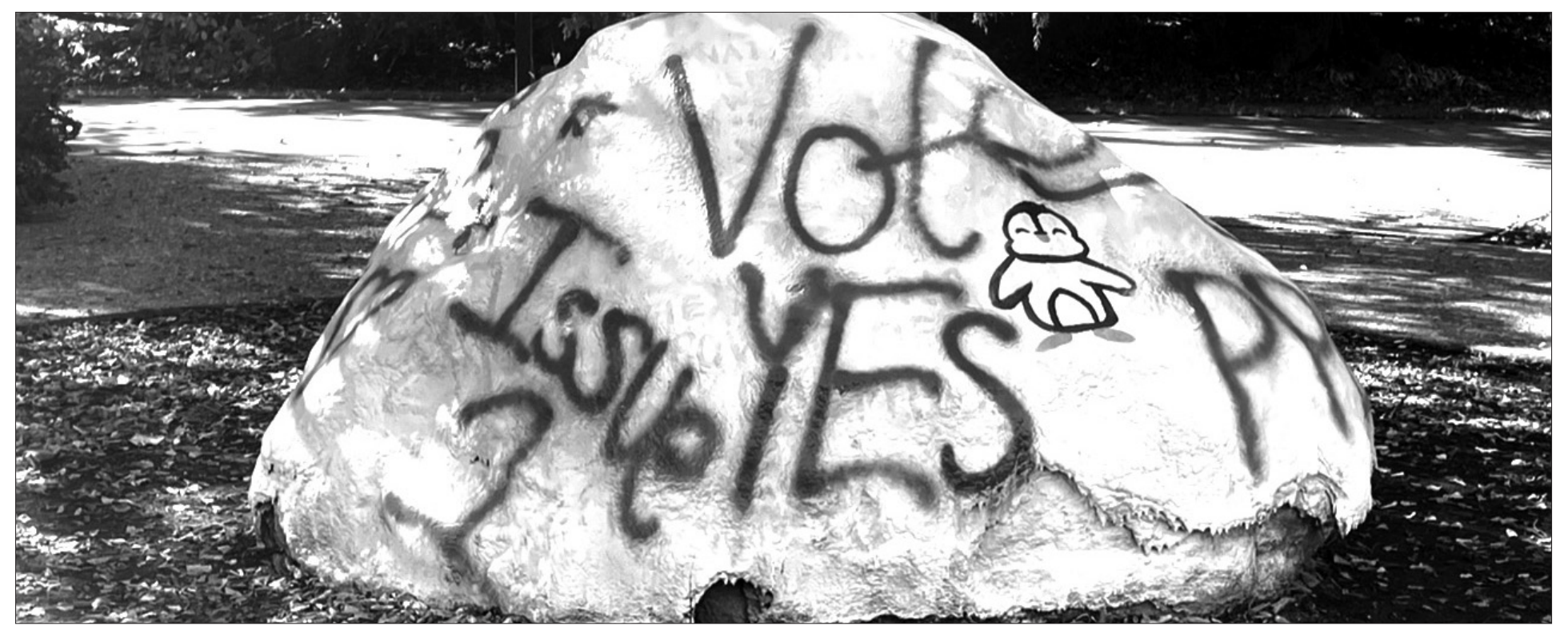
Planned Parenthood Generation Action painted the rock in support of Issue 1.

Founder of Mahoning Valley Sojourn to the Past