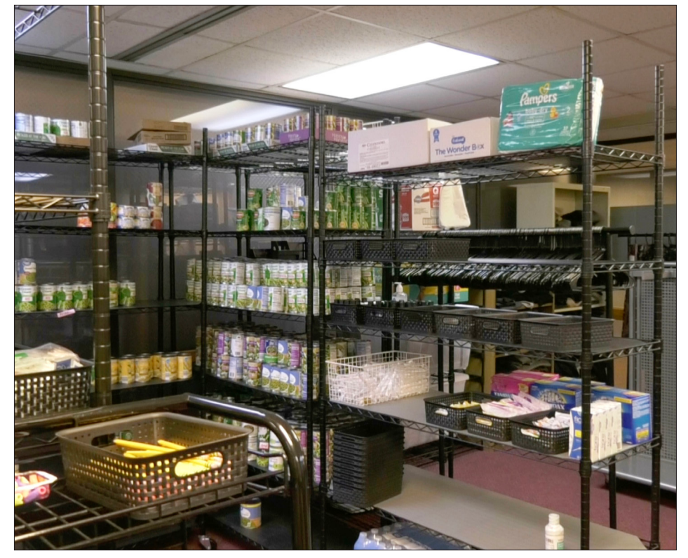
The SGA garden, which will be located in the Sandy Simon Greenhouse, will be the Penguin Pantry's first sustainable source of produce.