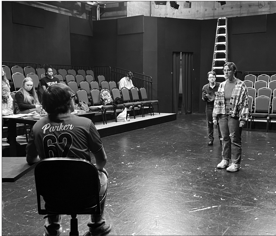
Students rehearse for "It's a Small World (Or the Robot Play)." Opening night is Feb. 16.