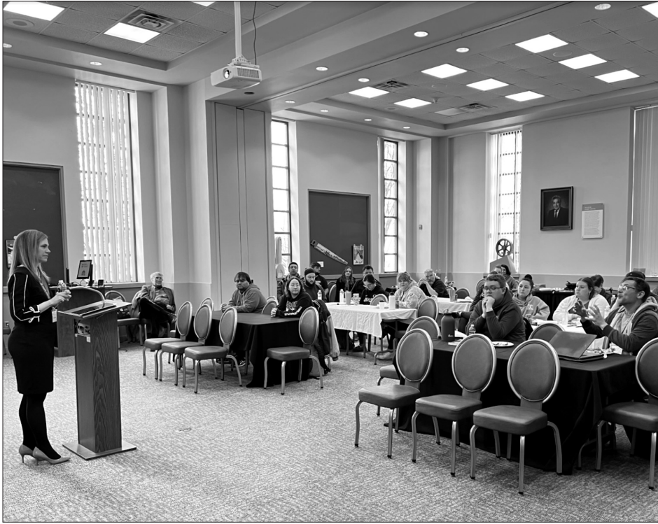
Last year's HATH conference in the Youngstown Historical Center of Industry and Labor.