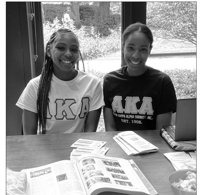
Greek Life members participate in community service (left and middle) and an organization fair (right).