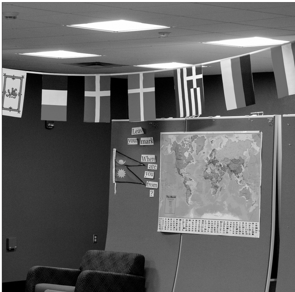
The International Programs Office is located in Jones Hall.