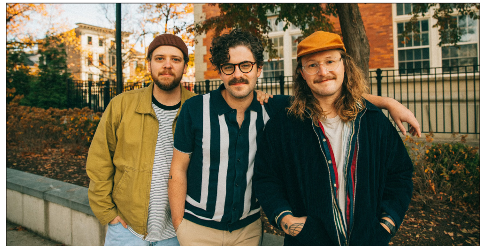
The Cincinnati-based band Coastal Club will perform in Cleveland on April 5.