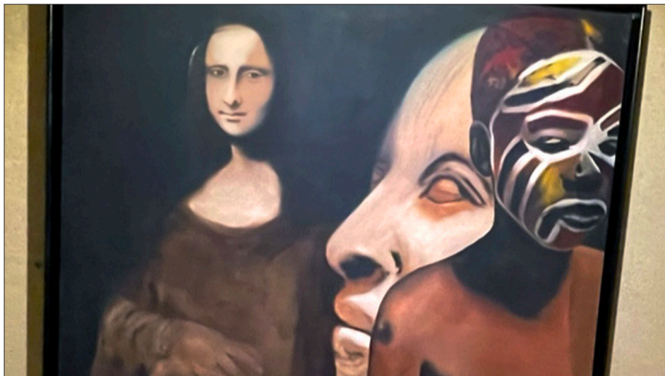
Works featured in Greatness Revealed: The Art of African Americans .