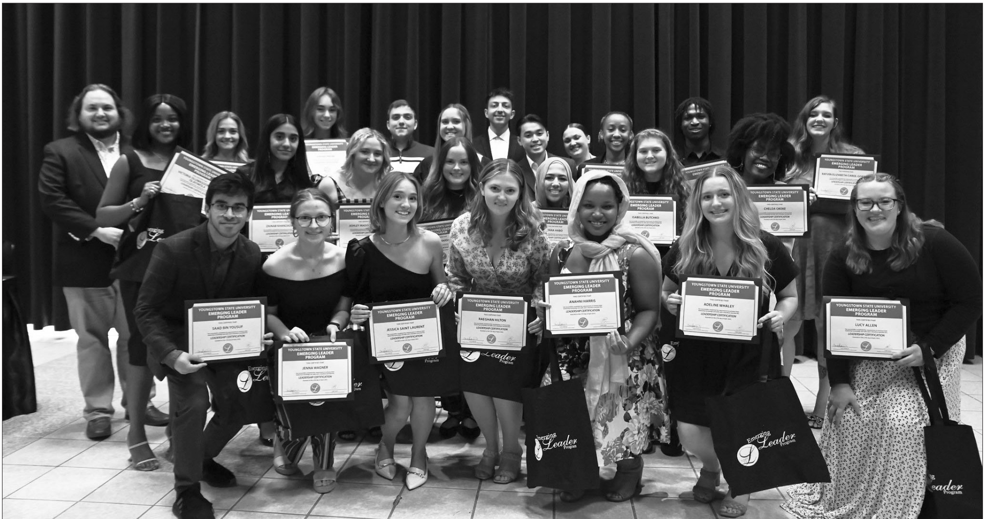
Members of the Emerging Leaders Program.