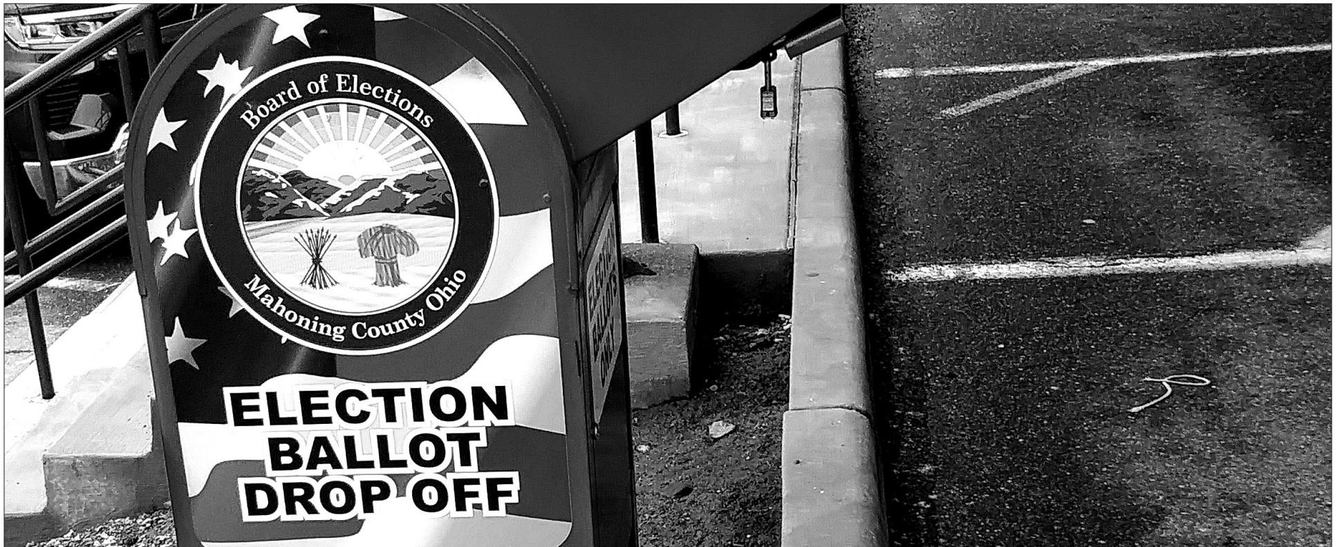
Residents can vote early at the Mahoning Valley Board of Elections.