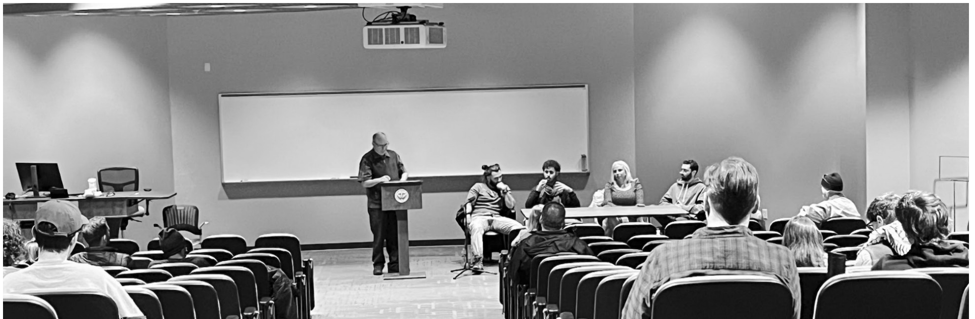
The Youngstown Area Jewish Federation hosted the survivors at the Jewish Community Center following their talk at YSU.

The four speakers shared their stories at the Jewish Community Center later that day for an event hosted by the Youngstown Area Jewish Federation.