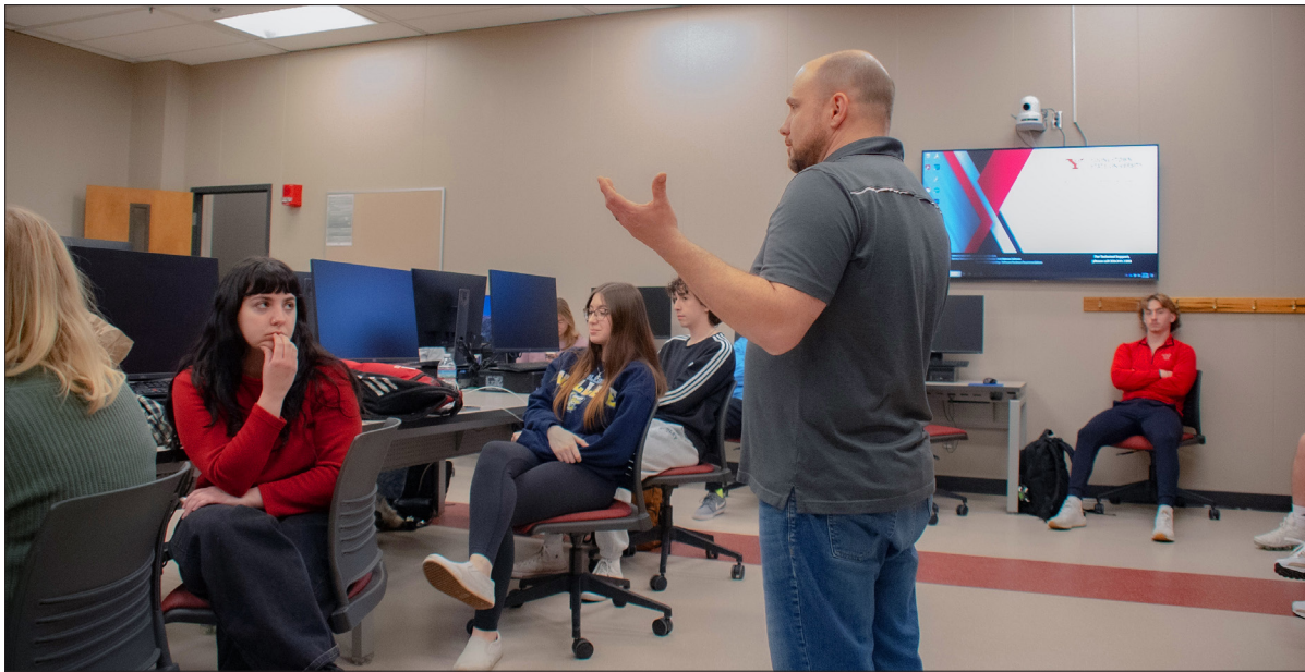
A professor teaching a class in Meshel Hall.