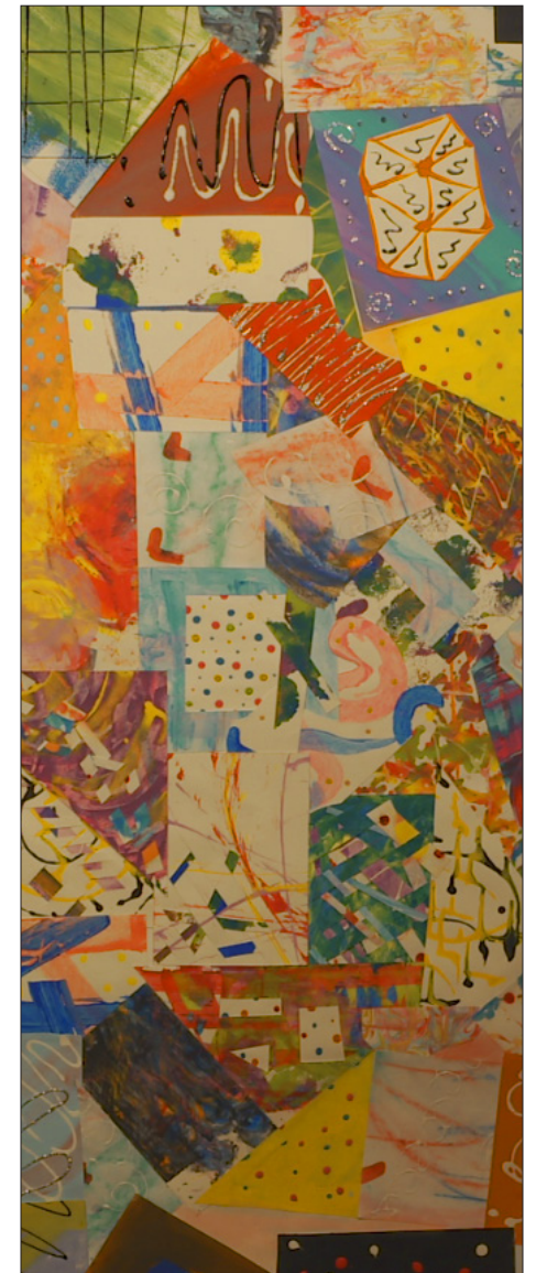
Artworks displayed at the 87th annual juried exhibition.