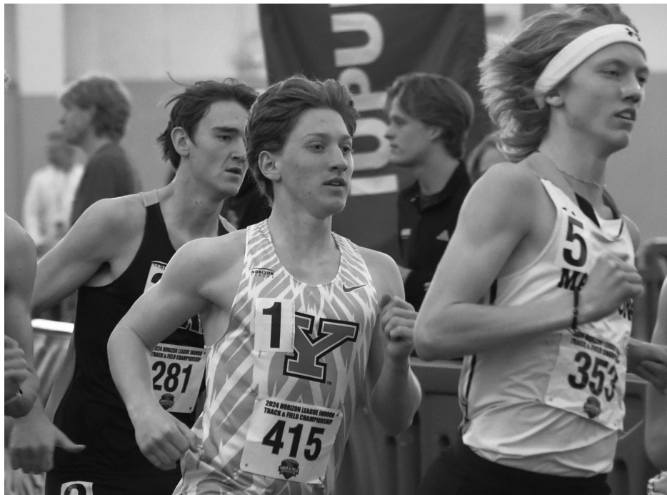
A YSU athlete competes at the Horizon League Indoor Championships.