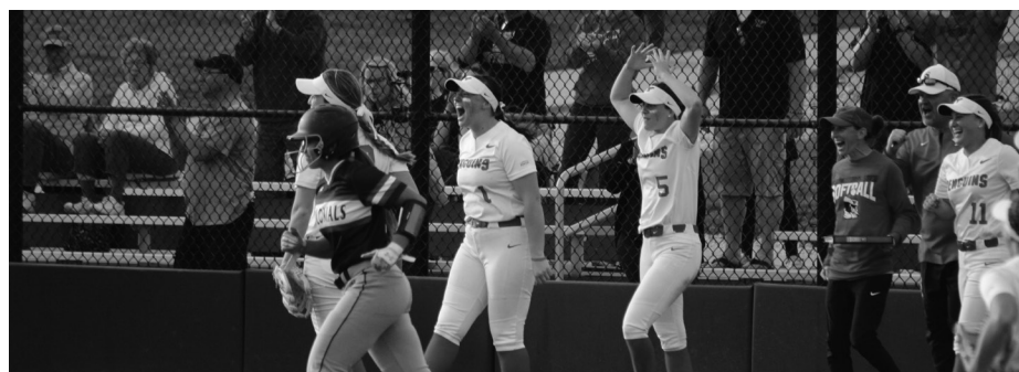
The softball team celebrates after a triple play.

The softball team will host three-game conference series against the University of Wisconsin-Green Bay. Game one will take place at 3 p.m. on March 29.