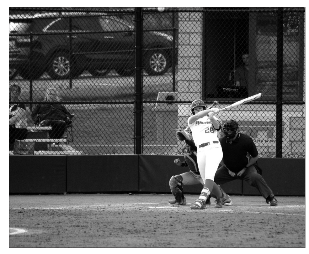
YSU softball prepares for postseason play as the regular season winds down.