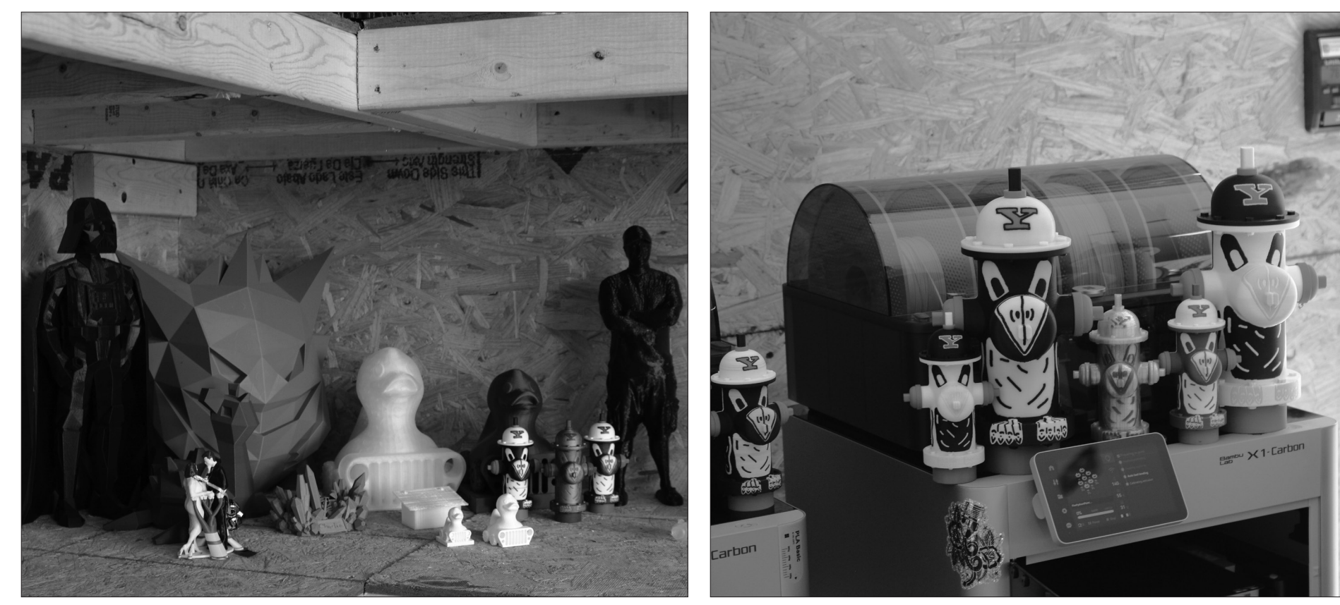
Simon has 3D printed numerous items, including miniatures of YSU Pete the Penguin fire hydrants.