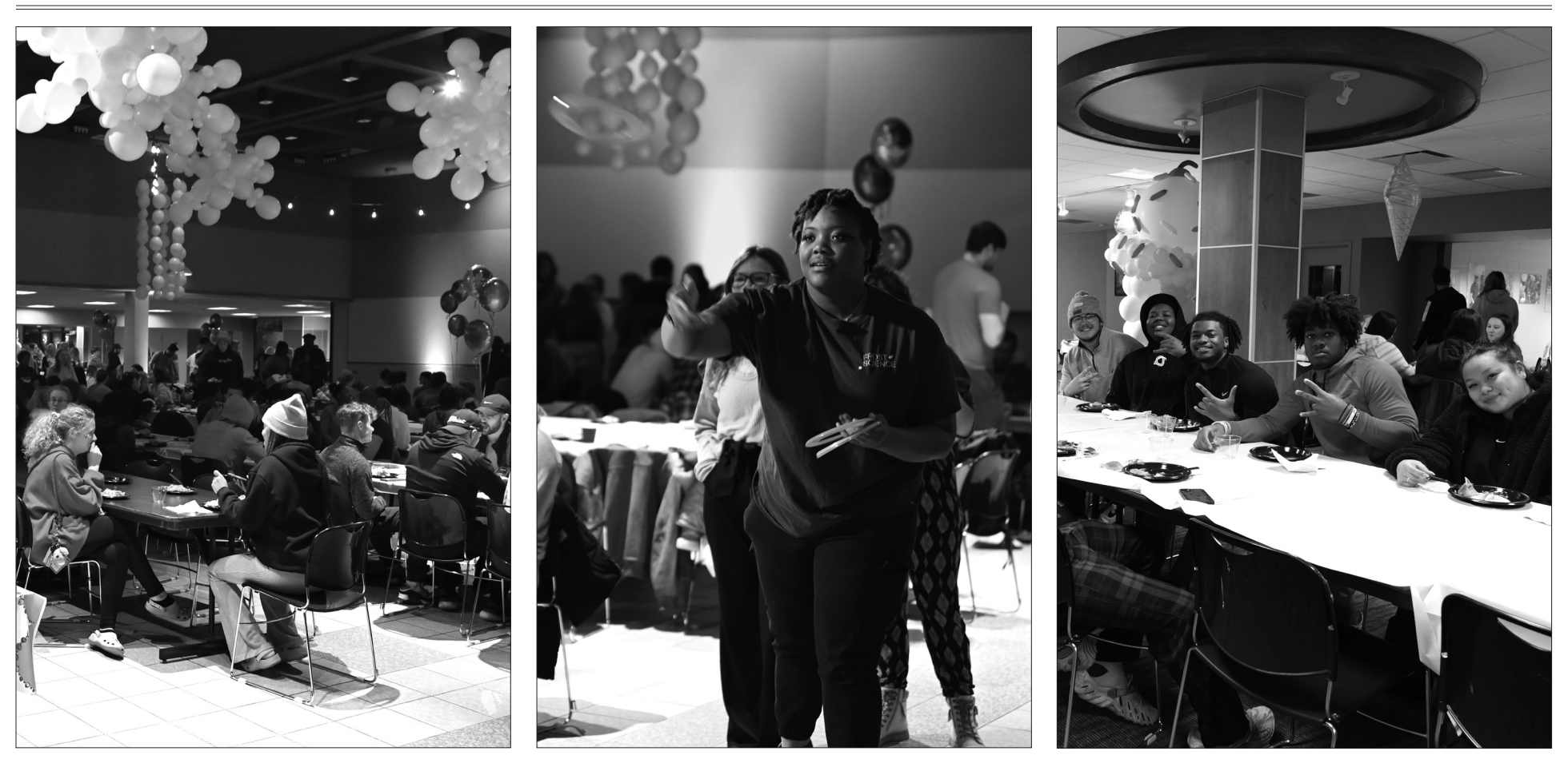
Hundreds of students gather for Midnight Breakfast at the end of every semester.