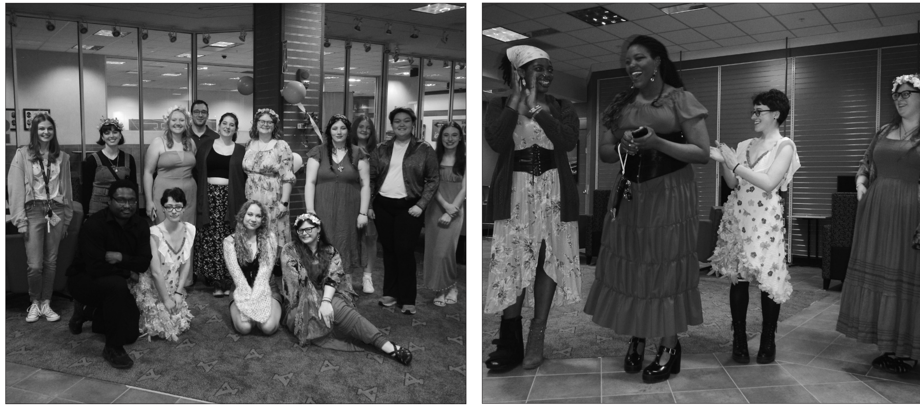
Gayla attendees (left) voted in the best-dressed competition by clapping for their favorite outfits of the night (right).

The YSUnity will also host a Lavender Graduation from 1 p.m. to 3 p.m. on April 26. The event will celebrate graduating LGBTQ students.