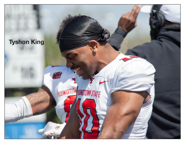
Portal players from men and women's basketball and football.

"He has seen what it takes to make your school marketable for these transfers to try to come in, and I know Youngstown State has a great staff behind the scenes,"