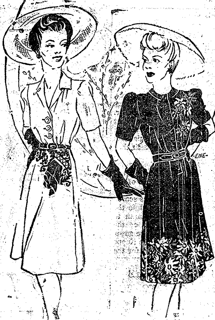
Two frocks with a Chinese touch—a black dragon scroll in soutache braid spans the hiplines of the shirtwaist number at left, with beige crepe buttons and a beige coolie hat, while at right is a sheer black crepe buttoned up the high front and appliqued in Chinese red at the bodice and around the skirt.