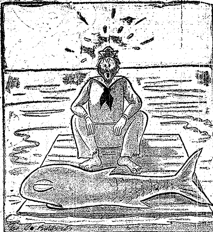
"Who'll ever believe it!"