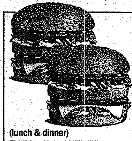
(lunch & dinner)

2 BIG MAC® SANDWICHES FOR $2.00 plus tax