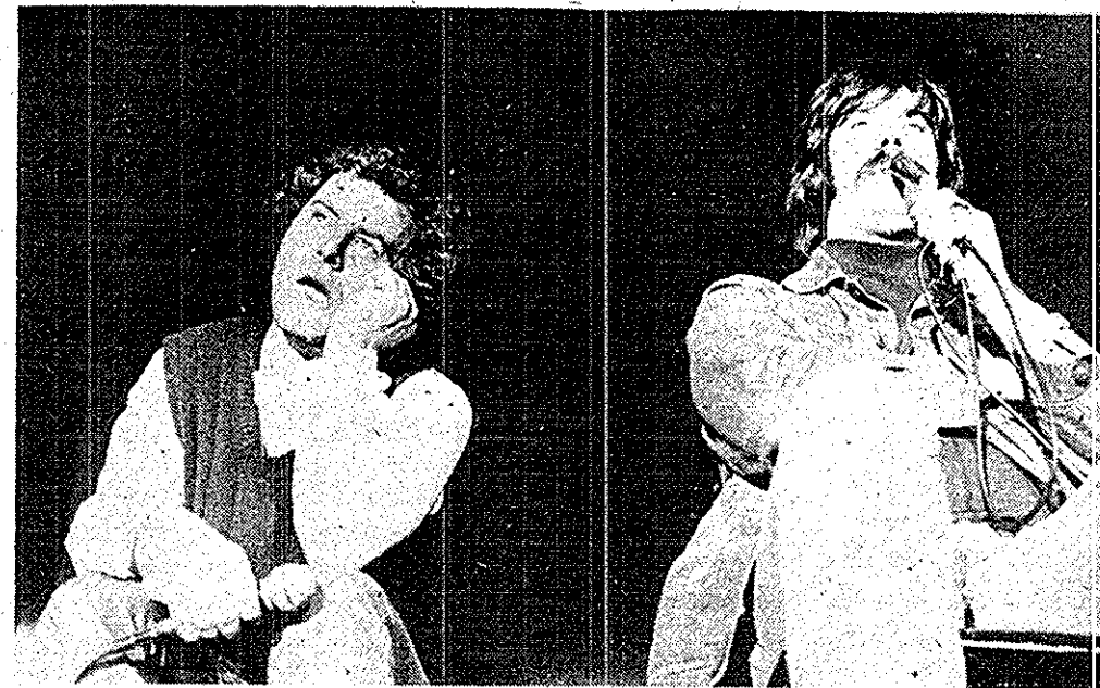
Edmonds & Curley Cafeteria