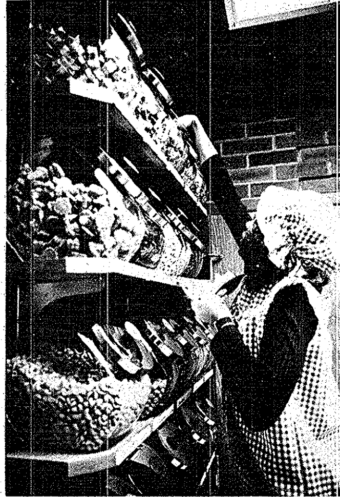
Candy Counter - Arcade