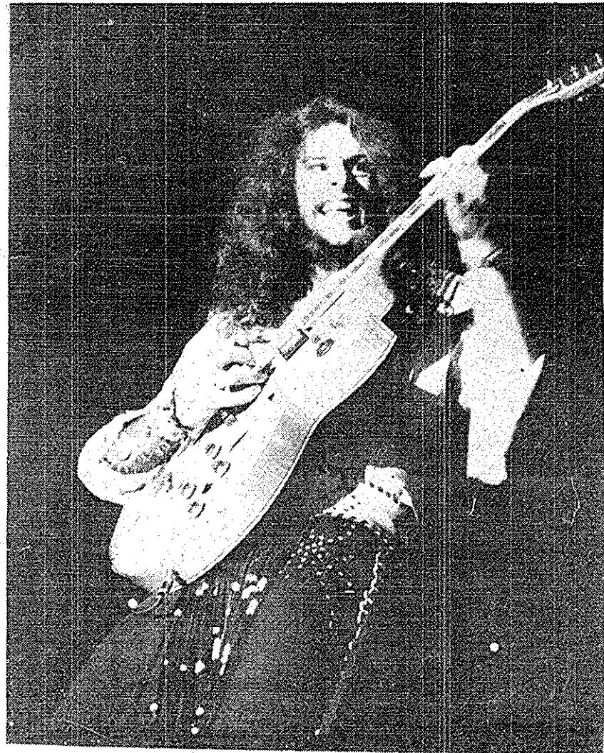
Ted Nugent & The Amboy Dukes Cafeteria