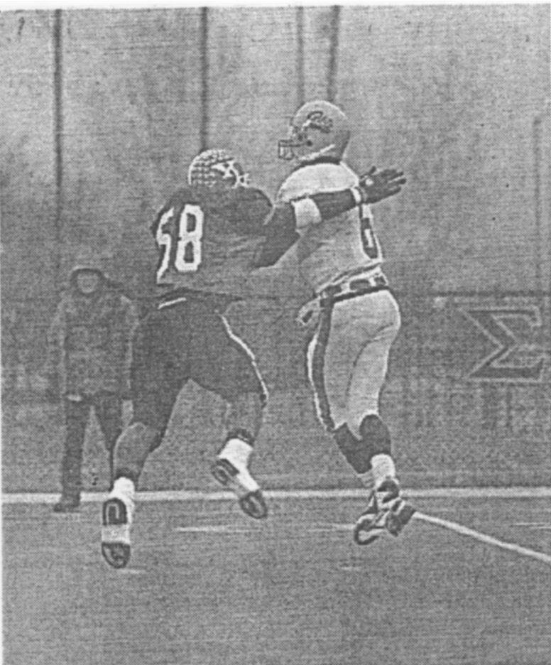
▲ Hopkins (58) defended YSU's home field against invading offenses.