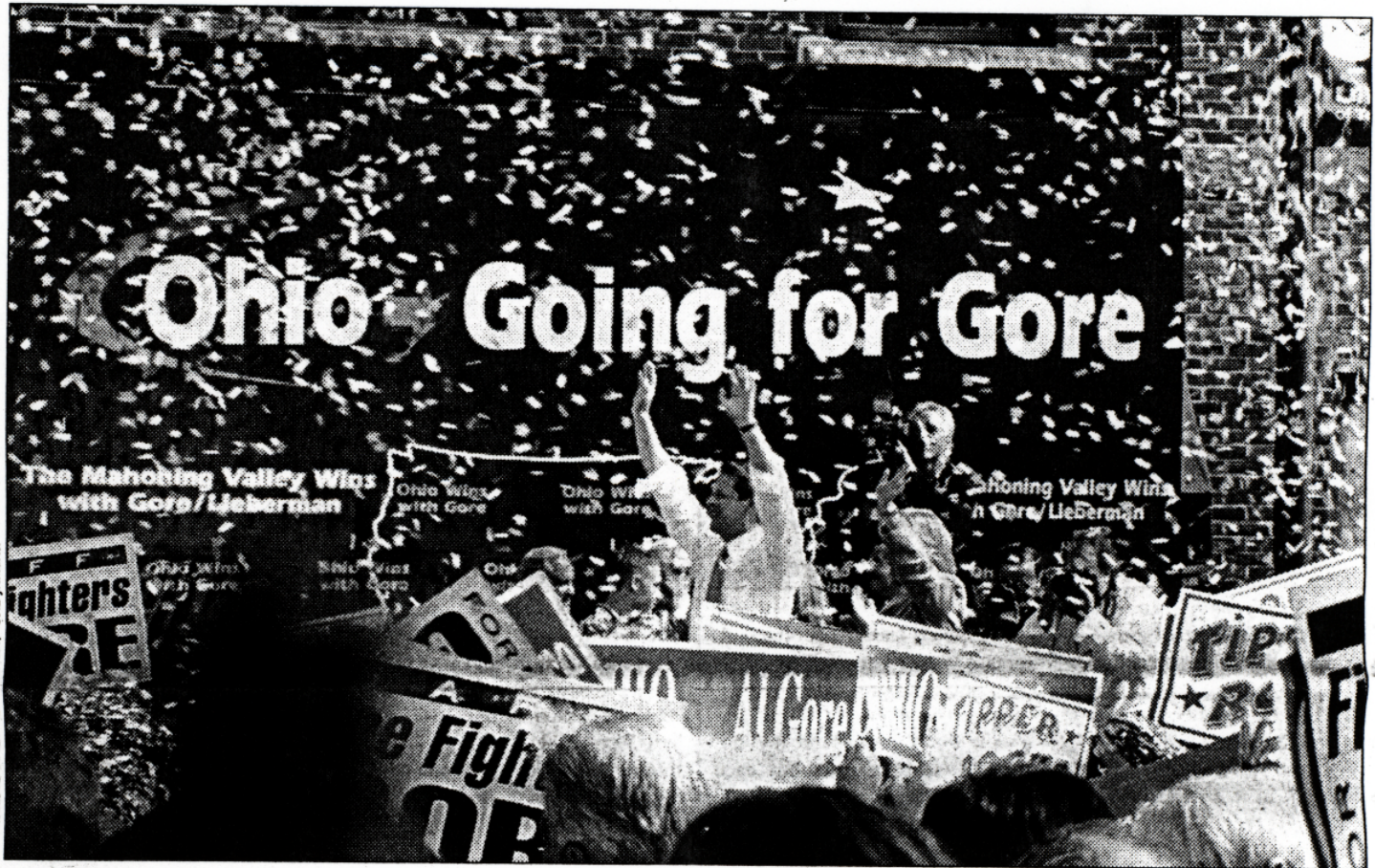
RALLY: Gore salutes the cheering crowd while red, white and blue confetti shoots out of twin cannons.

Gore made a strong appearance at the rally, coloring his