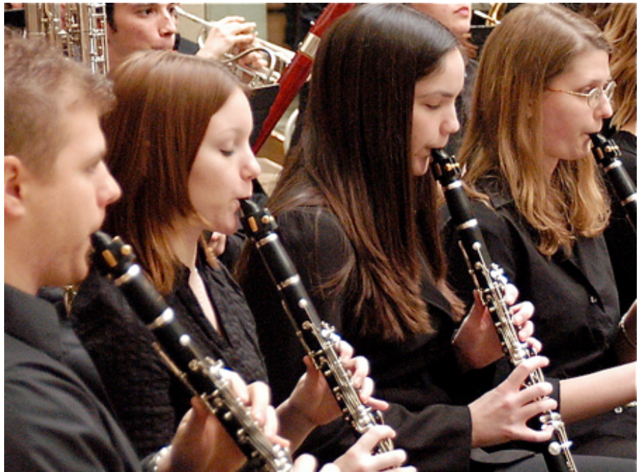
This week's free Music at Noon concert features Dana School of Music's Clarinet Studio recital.

For more information, call 330-941-3636.