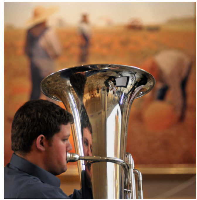
The Dana School of Music's Octubafest starts this Friday.

Ladies" in Spotlight Arena Theater. Friday and Saturday performances begin at 7:30 p.m. , with the Sunday matinee performance at 3 p.m. Tickets may