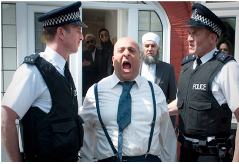
The Youngstown Area Jewish Film Festival, sponsored in part by the YSU Center for Judaic and Holocaust Studies, opens this week. Shown above is a scene from Infidel , one of featured films.