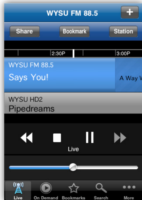
This is how the new app from WYSU appears on