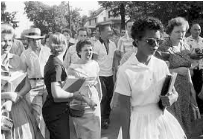
Minniejean Brown Trickey, shown here entering Little Rock Central High School in 1957.

A reception will be held 5:30 to 6:30 p.m. in the Museum of Labor and Industry on Wood Street. The reception will include a performance by the Youngstown Connection.