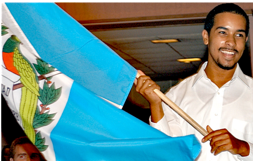
The flag ceremony is a traditional part of the YSU Hispanic Heritage Celebration, which this year is Friday, Sept. 24.

The awards are open to all Hispanic/Latino students who demonstrate academic excellence, civic commitment, successful leadership qualities, or have made a significant transformation in their lives. Nominations will be accepted