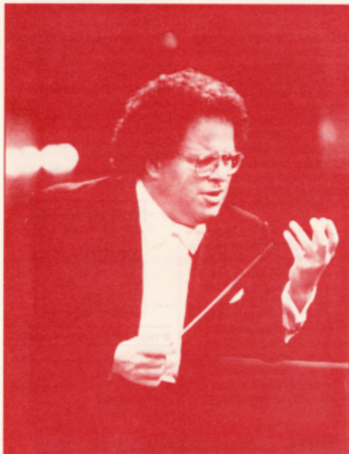
James Levine, Artistic Director Metropolitan Opera

The 52nd consecutive season of Texaco-Metropolitan Opera live Saturday afternoon radio broadcasts will begin on December 7, at 1:30 p.m. on WYSU with Mozart's Così fan tutte and will continue through April 18, 1992, for a total of twenty Saturday matinees.