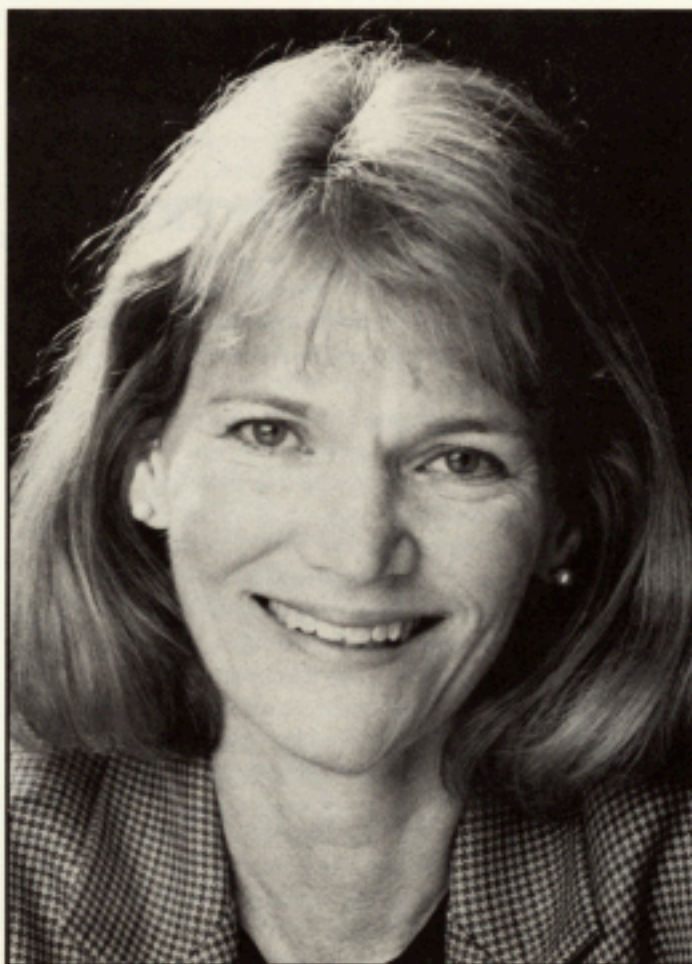
Martha Raddatz, one of National Public Radio's top correspondents.

4/26 Cedar Walton. A reliable and inventive modern-jazz pianist.