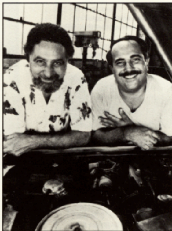
Tom and Ray Magliozzi, hosts of Car Talk .

You can catch Car Talk every Saturday morning at 10:00, and Sunday afternoon at 3:00 on WYSU-FM.