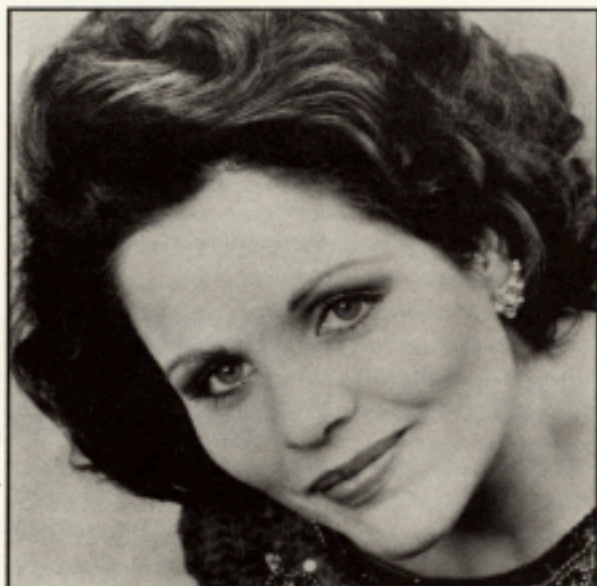
Renee Fleming is featured in the Metropolitan Opera's production of Charles Gounod's Faust , on Saturday, April 5 at 1:30 pm.

4/25 GIORDANO: Fedora . Roberto Abbado, conductor. Cast: Mirella Freni, Ainhoa Arteta, Placido Domingo, Dwayne Croft. Fedora Romanov's scheme of vengeance for the murder of her fiance goes awry when she falls in love with the prime suspect.