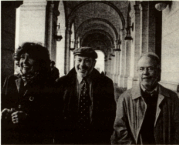
Linda Wertheimer, Robert Siegel, Noah Adams.