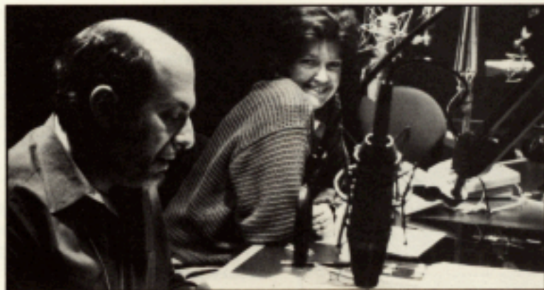
Robert Siegel and Linda Wertheimer are two of the three hosts—the other is Ray Suarez—who bring you All Things Considered on weekday evenings from 5:00–7:00.