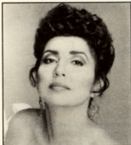
Maria Guleghina sings the role of Abigail in the Metropolitan Opera's broadcast of Nabucco on Saturday, March 24 at 1:30 pm.