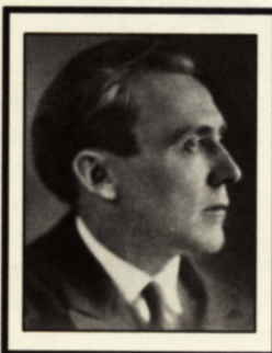
American symphonic composer Roy Harris.

This year marks the centennial of composer Roy Harris, one of the most important figures in the establishment of an American symphonic music. His first symphonies, especially the Third of 1939, created a sensation for their vivid power and unabashed exuberance. American themes dominated Harris's creative output, which eventually totaled more than 200 works.