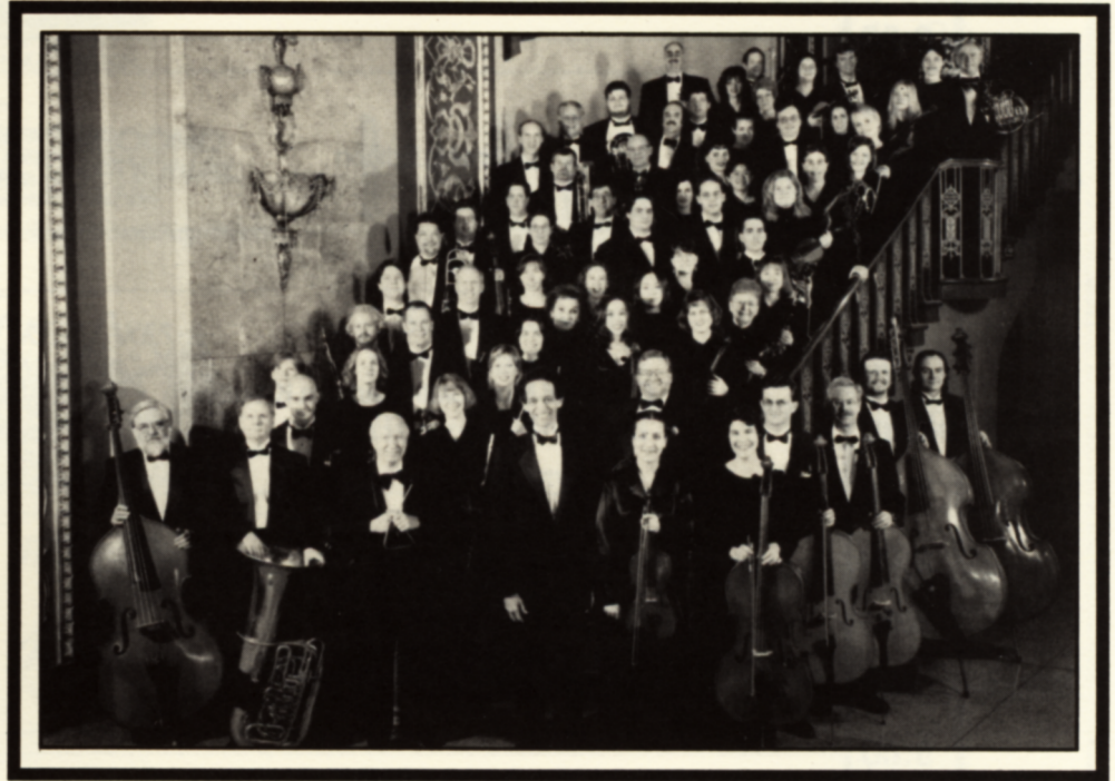
Youngstown Symphony Orchestra