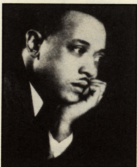
William Grant Still is one of many composers featured on Beyond Joplin: A Celebration of Black Classical Music , airing Thursdays at 11:00 am, February 5th, 12th, and 19th.