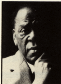
Singer William Warfield provides critical commentary in Classically Black: Robeson! Thursday, February 26th at 11:00 am.