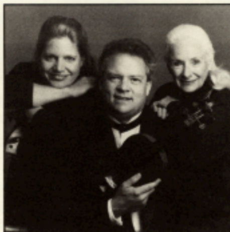
The Eaken Piano Trio will be performing on Friday, October 8 at 8:00 pm in the Bliss Recital Hall.

WYSU-FM celebrates 30 years of broadcasting this October, and part of the celebration will include an appearance by the highly acclaimed Eaken Piano Trio, sponsored by WYSU-FM and YSU's Dana School of Music. The Eaken Piano Trio is a professional ensemble committed to the performance and enrichment of chamber music through concert appearances, recordings and educational programs for students of all ages. They have performed extensively across the United States, Europe and Canada, and they also maintain a busy recording schedule as well. In 1996 the ensemble's holiday radio program, Home for the Holidays , was heard on more than 150 stations nationwide, and that successful reception prompted its release on compact disc. That album is one of the group's eight CDs, all of which are currently available.