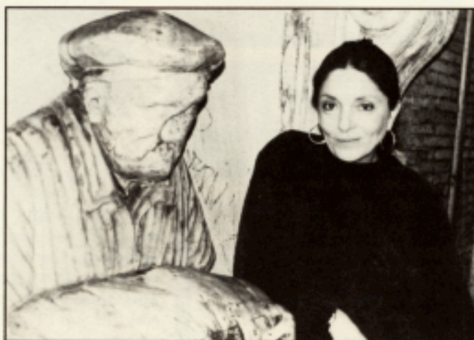
Sylvia Poggioli, NPR correspondent, based in Italy.