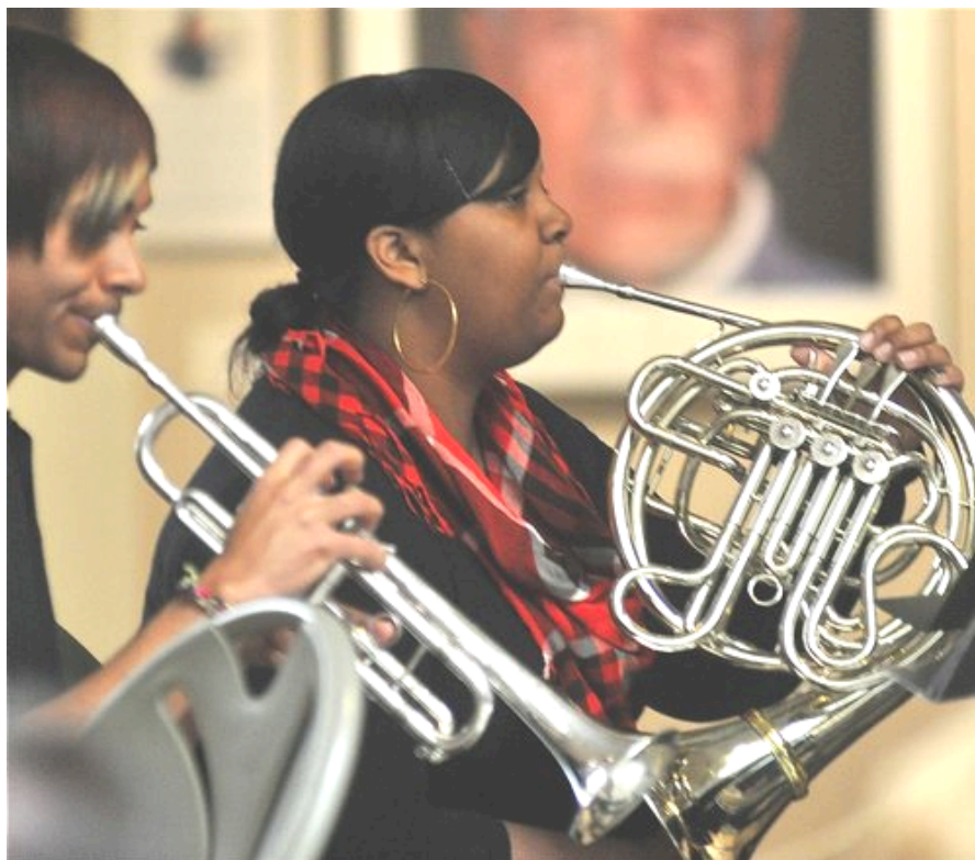
The Dana School of Music kicks off the spring semester Music at Noon concerts with a performance of brass chamber music 12:15 p.m. Wednesday, Jan. 19, in the Butler Institute of American Art. The weekly concerts are free.

Thursday, Jan. 20, 8:30 a.m. The annual Martin Luther King Jr. Diversity Breakfast is in the Chestnut Room of Kilcawley Center. The cost is $20 a ticket, or $160 for a table of eight. For more information, contact the Office of Student Diversity Programs at 330-941-2086.