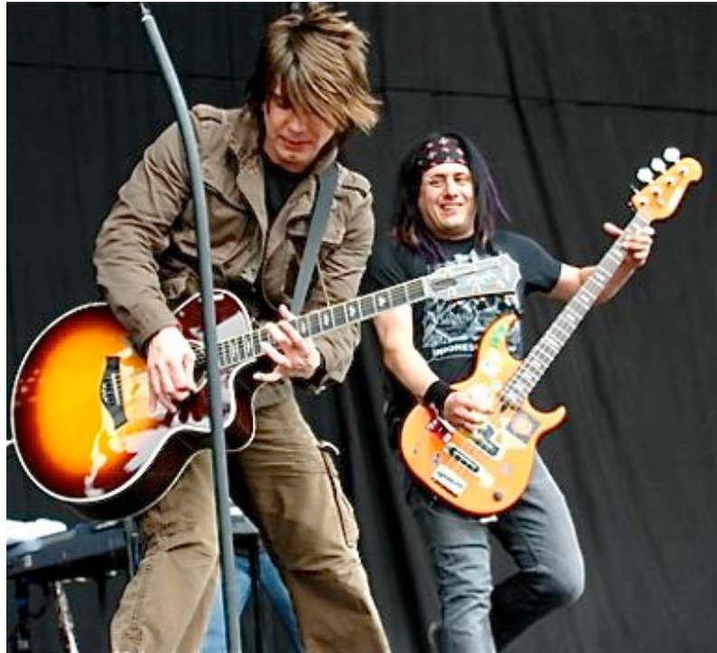
The Goo Goo Dolls perform April 12 at the Covelli Centre as part of the YSU Penguin Productions.

The Goo Goo Dolls have remained a household name in the United States and have proven their success by selling nearly 9 million albums with Top 10 songs such as Name , Iris , Black Balloon and Slide . The group