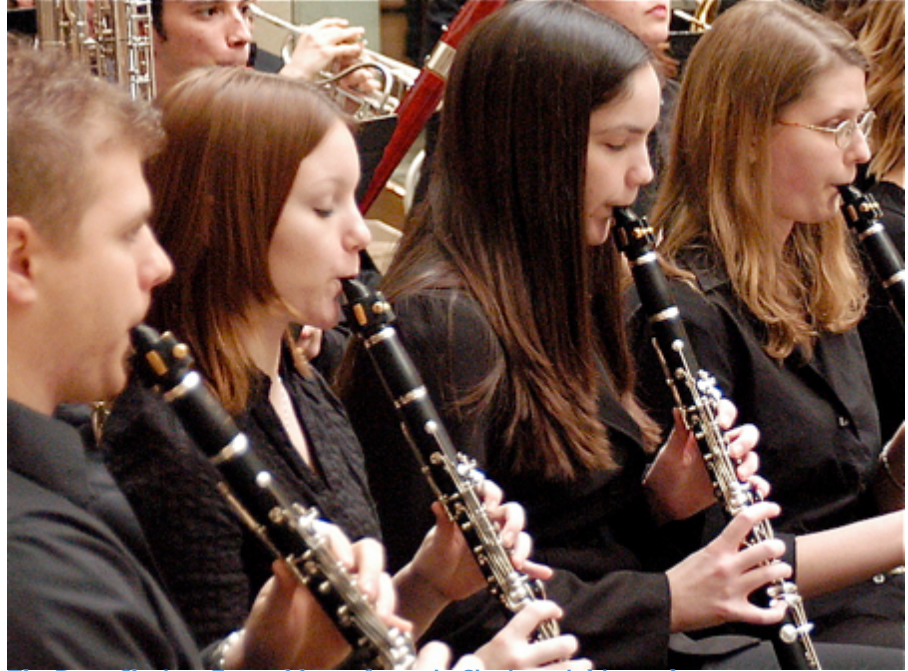
The Dana Clarinet Ensemble performs in Cincinnati this week.

The YSU Wind Ensemble, consisting of 52 of the top woodwind, brass and percussion students in the Dana School of Music, has a rich history of feature performances, including numerous OMEA conventions, College Band Directors National Association conferences, National Association for Music Education conventions, and a premier performance in New York's Carnegie Hall for the 2005 New York Wind Band Convention. The group has six critically acclaimed CD recordings.