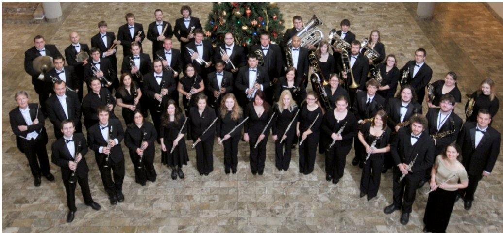
The Youngstown State University Wind Ensemble

The Youngstown State University Wind Ensemble opens its fall 2011 performance season with a special outdoor concert, featuring songs in commemoration of the 10 th anniversary of the Sept. 11 terrorist attack.