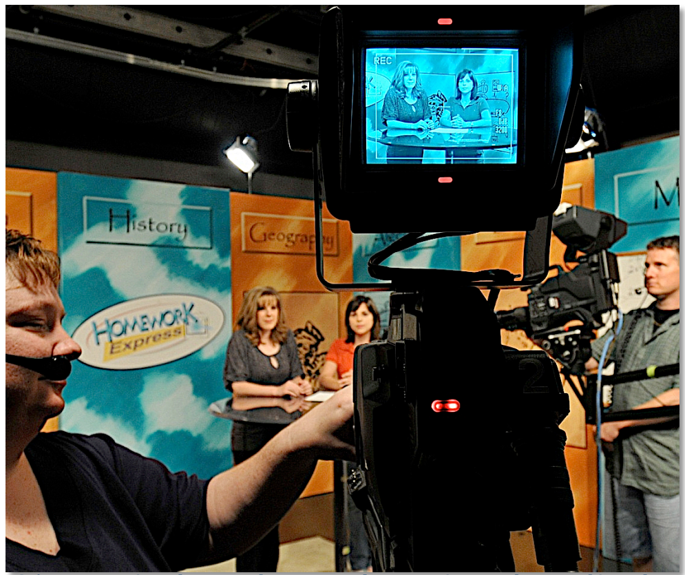
YSU's Emmy-nominated Homework Express TV show starts its seventh season this week, broadcasting to more than a million households throughout northeast Ohio. Read more in this week's YSU News Brief.