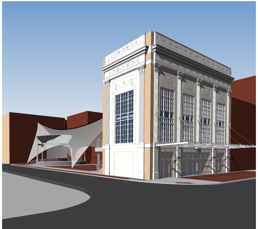
Rendering by Strollo Architects of the restored terracotta façade of the Paramount Theater in downtown Youngstown.