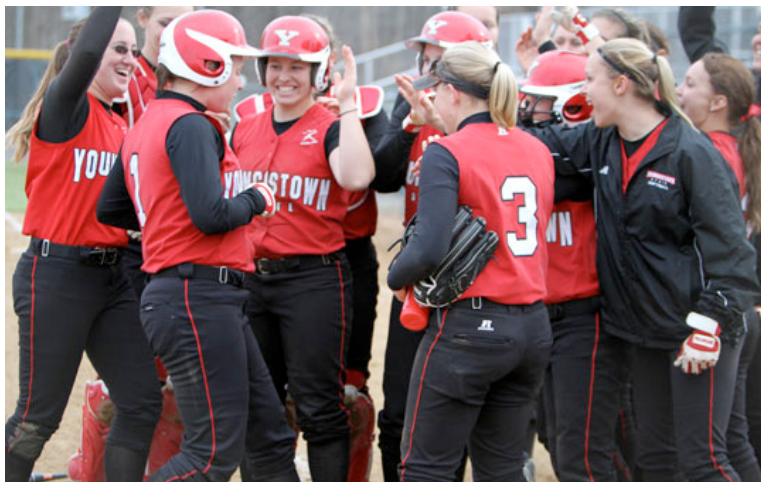
The YSU softball team opens its home schedule this week.

Wednesday, March 21, 3 p.m. and 5 p.m. The YSU softball squad opens the