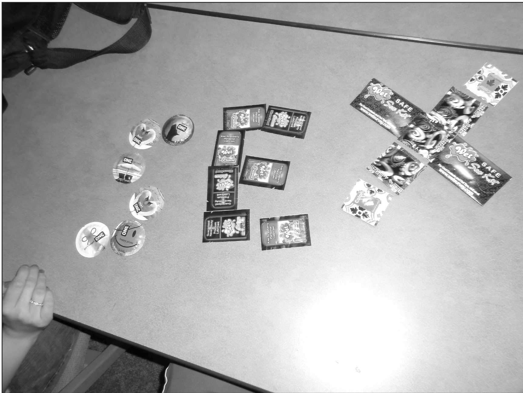
A passion party is a gathering that explores human sexuality in a judgment-free environment. On Tuesday, a passion party was held in Cafaro House for the YSU community.