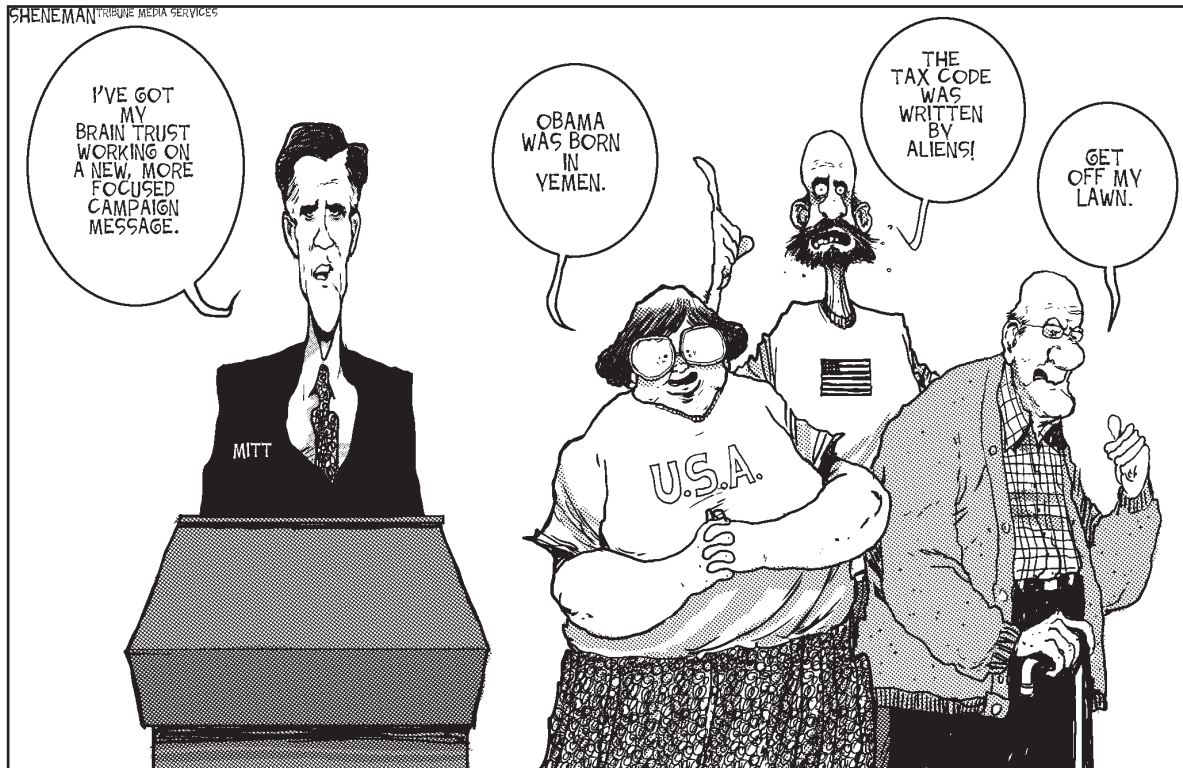
The opinions of this artist do not necessarily reflect those of The Jambar.

The rights of definite people outweigh those of potential gods.