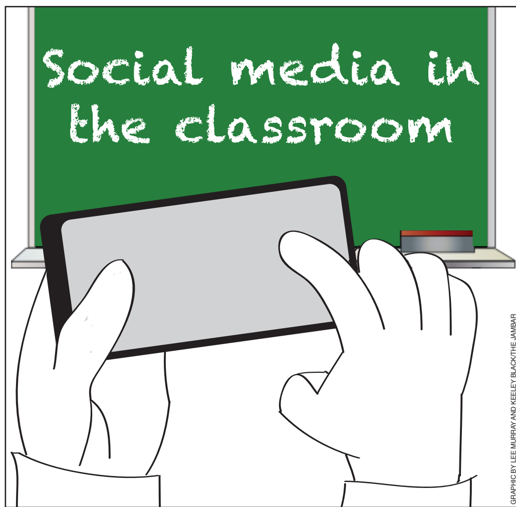
GRAPHIC BY LEE MURRAY AND KEELEY BLACK/THE JAMBAR

The site allows him to get feedback on what lectures