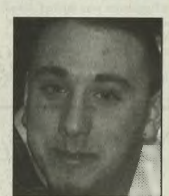
"I feel like crap. I'm sick. I want to go home and go to sleep."