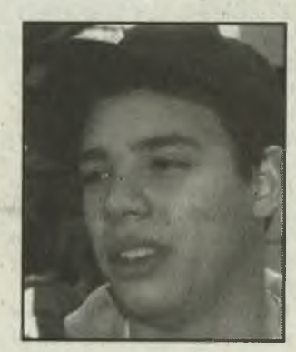
"I hope Pittsburgh loses on Sunday."