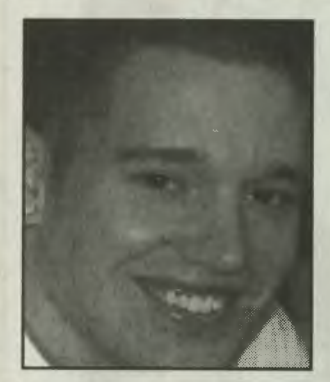
"Don't let friends borrow your car, because they lose your keys."