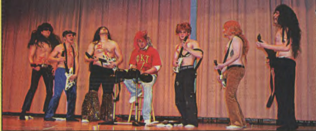
Members of Phi Kappa Tau fraternity rock out at Austintown Fitch High School for YSU's 2008 Greek Sing.