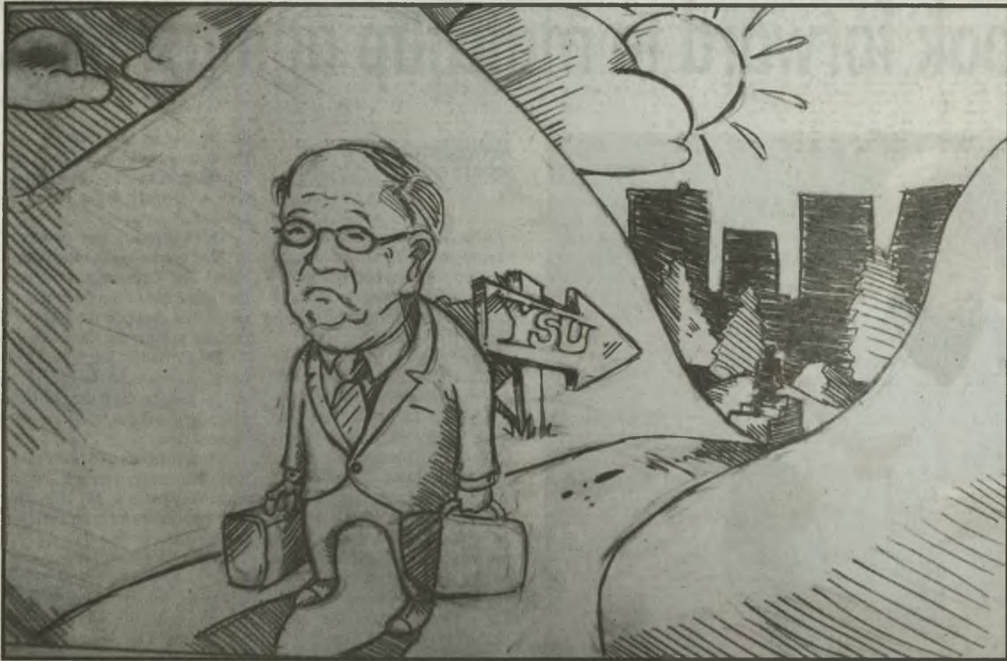
The views of this syndicated artist do not necessarily agree with those of The Jambar.

The views and opinions expressed in letters and commentaries on the opinion page do not necessarily reflect those of The Jambar staff. Editorials do not necessarily reflect the opinions of the faculty, staff or administration of Youngstown State University.