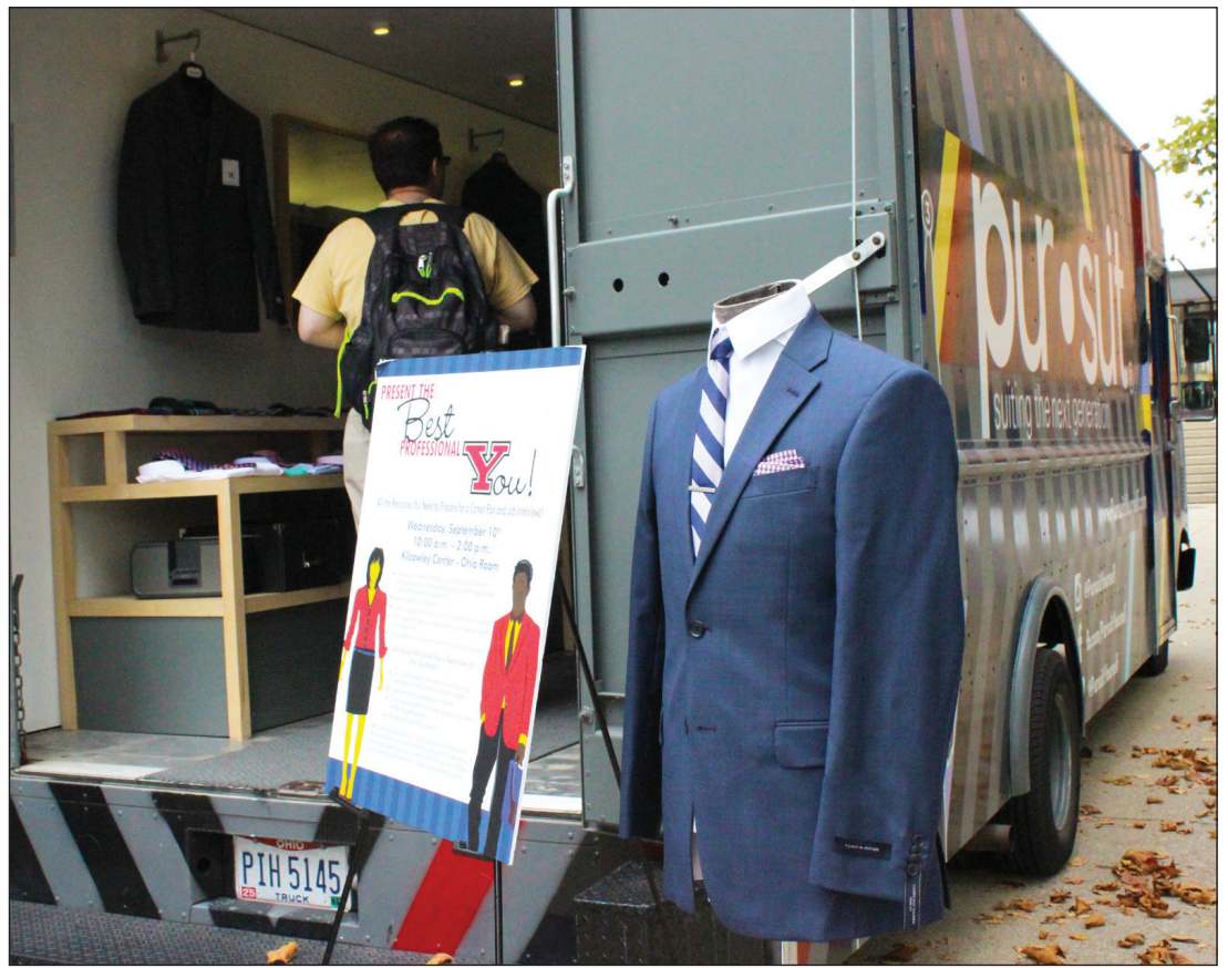
Recognizing the need for young men to look professional while job hunting, the Columbus-based tailor Pursuit visited campus to fit young men and offer deals on suits.