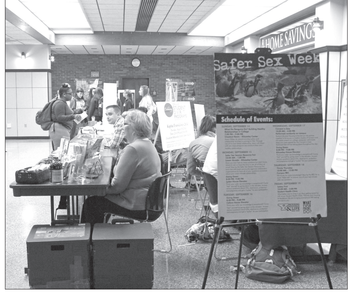
Information concerning safe sex practices was made available through an information fair at Kilcawley Student Center, the first of many events planned for Safer Sex Week.

The university works in tandem with the graduate students to approve and or-