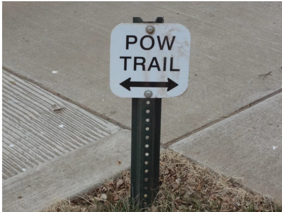
Figure 4 – POW Trail Sign 10

in the future a Camp Alva museum will be opened in the small Oklahoma town. One of the most publicized events that exemplified the legacy of Camp Alva transpired in 1988 when several prisoners returned to tour Alva and the neighboring cities where camps were located.