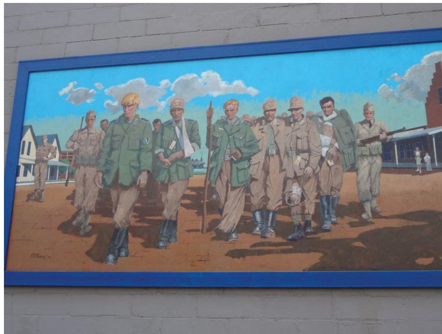
Fig.1 – “Alva POW Camp” by the Alva Mural Society (2012) 20

commissioned and non-commissioned soldiers. Along with the barracks the camp was filled with a plethora of other buildings including a recreation area, library, infirmary, canteen fill, and other administrative buildings, which were all built on a “square mile of land one mile south and west of Alva.” 19 Interestingly because of the angst that was growing amongst the Alva citizens after the announcement by Captain Tremblay, Alva natives were invited to come and tour the facilities that were being built for the German prisoners before they arrived, but after the group of 19 American guards arrived. This was to assure the public that the necessary security measures were being used to keep the Alva community secure.