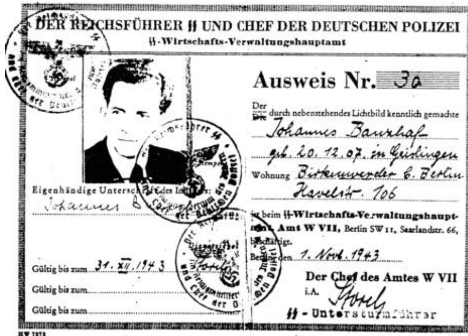
Figure 3— Waffen-SS Card for Johannes Banzhaf 83

Second World War makes sense that it was this popular at Camp Alva. Not only did they know that the work was coming from a fellow Nazi, but it was something that they had already been accustomed to in the German nation.