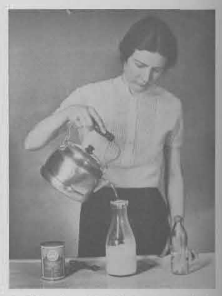
2. Fill with cold boiled water and mix