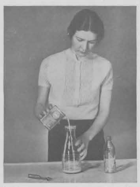
I. Empty one can into a quart milk bottle.