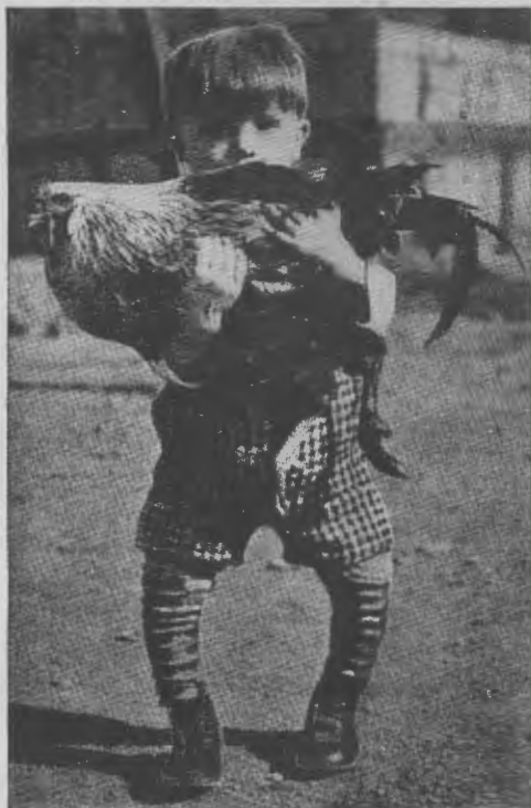
Example of severe rickets in a sunny climate.

L EST WE FORGET—we who are of the vitamin D era—severe rickets is not yet eradicated, and moderate and mild rickets are still prevalent. Here is a white child, supposedly well fed, if judged by weight alone, a farm child apparently living out of doors a good deal. This boy was reared in a state having a latitude between 37^{\circ} and 42^{\circ} , where the average amount of fall and winter sunshine is equal to that in the major portion of the United States. And yet such stigmata of rickets as genu varum and the quadratic head are plain evidence that rickets does occur under these conditions.