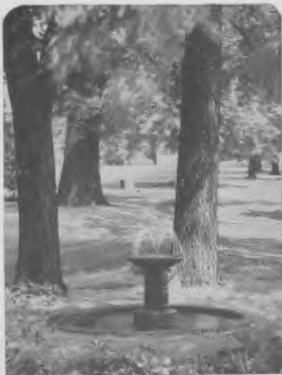
View of Fountain from "Brownstone" House