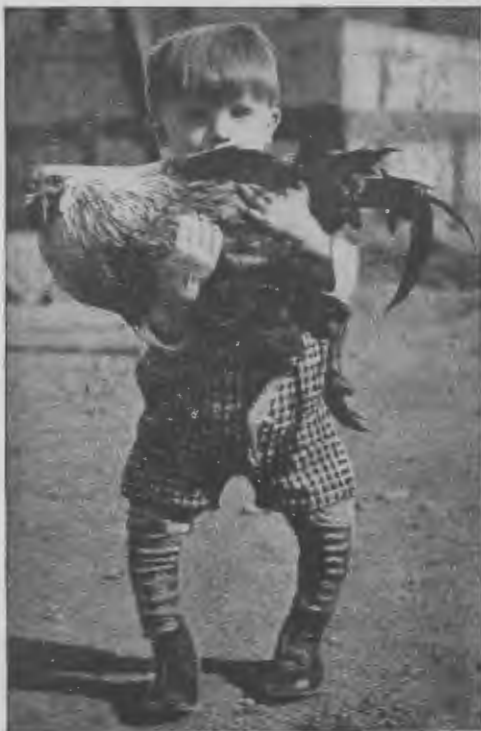
Example of severe rickets in a sunny climate.

L EST WE FORGET—we who are of the vitamin D era—severe rickets is not yet eradicated, and moderate and mild rickets are still prevalent. Here is a white child, supposedly well fed, if judged by weight alone, a farm child apparently living out of doors a good deal. This boy was reared in a state having a latitude between 37° and 42°, where the average amount of fall and winter sunshine is equal to that in the major portion of the United States . And yet such stigmata of rickets as genu varum and the quadratic head are plain evidence that rickets does occur under these conditions.