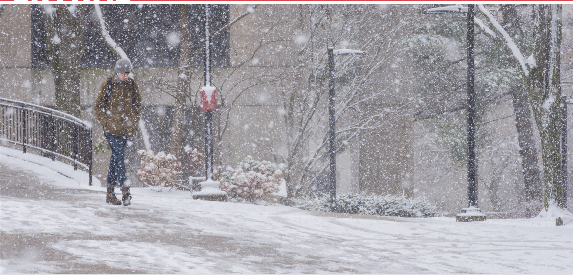
A student walks through campus near the Maag Library during a heavy snowfall on Tuesday.