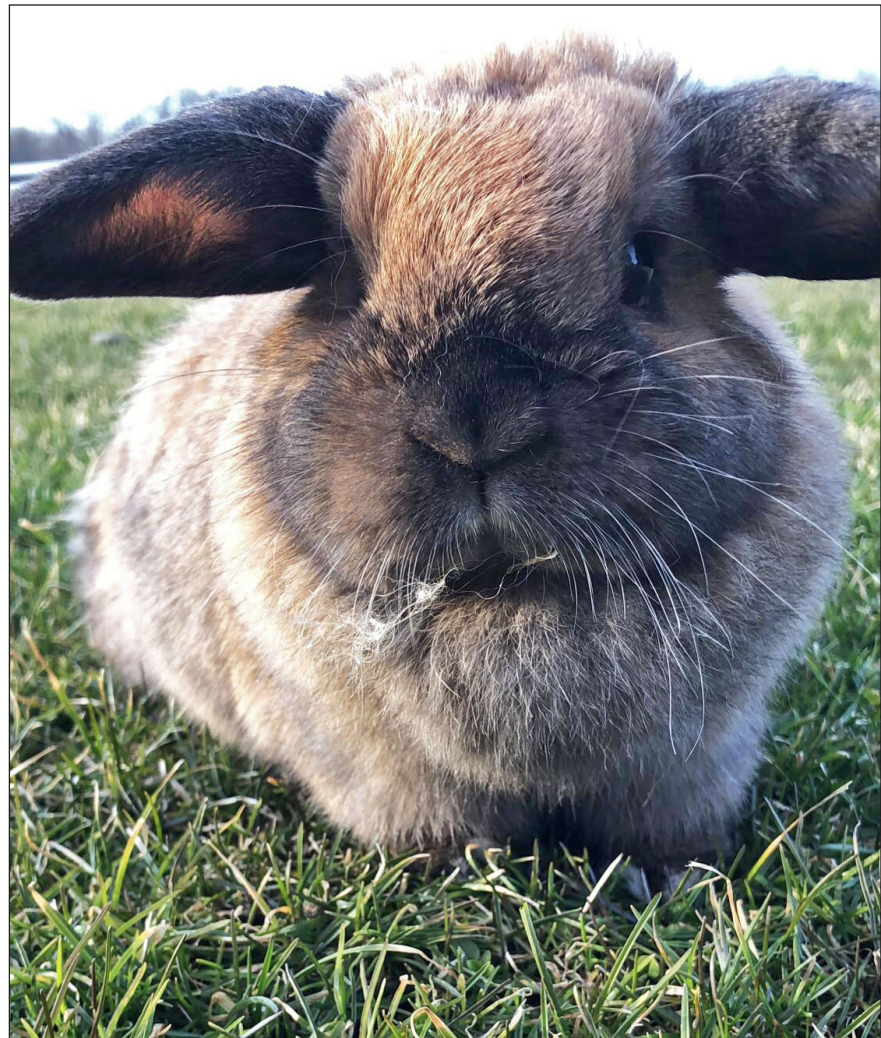
Pictured: Thumper the Easter Bunny