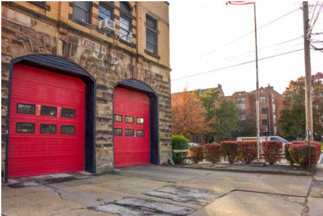
Youngstown's Fire Station 7 has been serving the Youngstown area for 116 years.