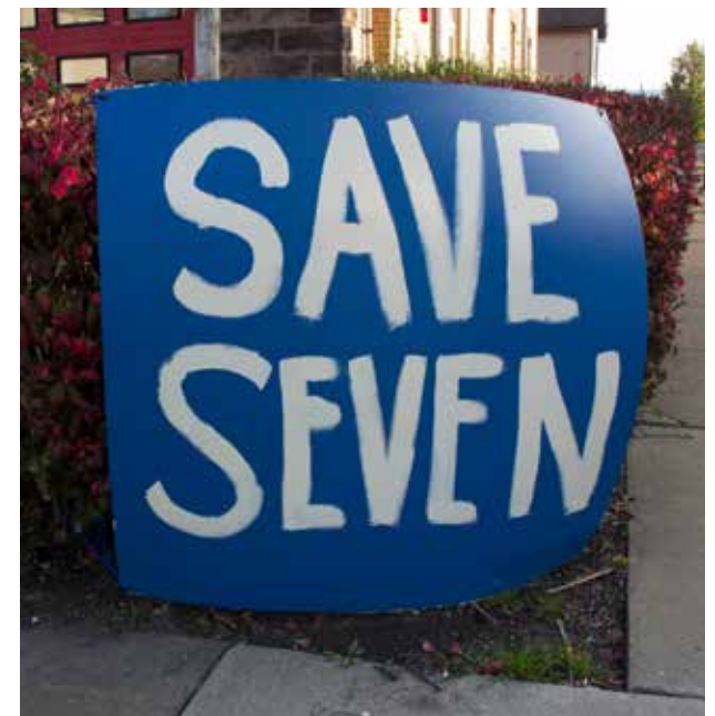
A lone sign sits in front of Station 7 on Elm Street.