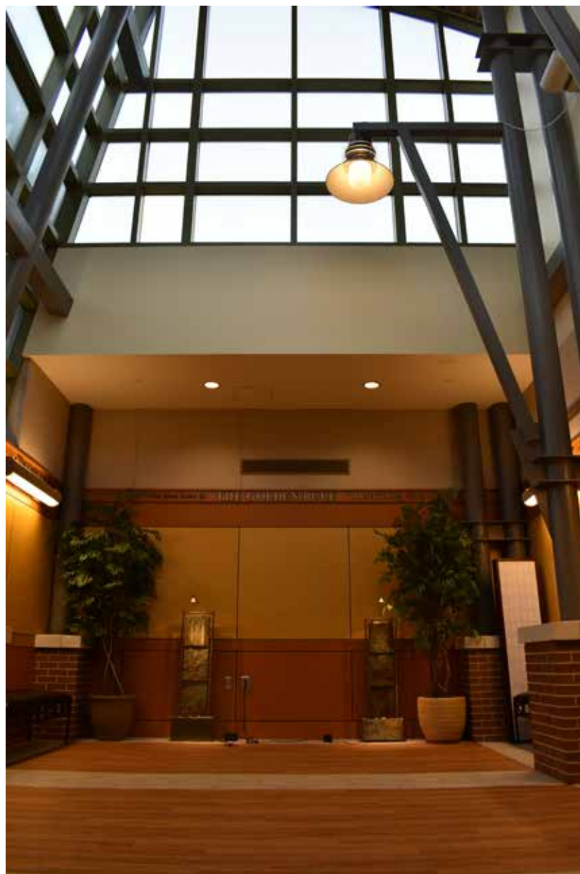
The Andrews Rec Center meditation room gives students a quiet and peaceful place for prayer or meditation needs.

“I just think it would be better if domestic students hung