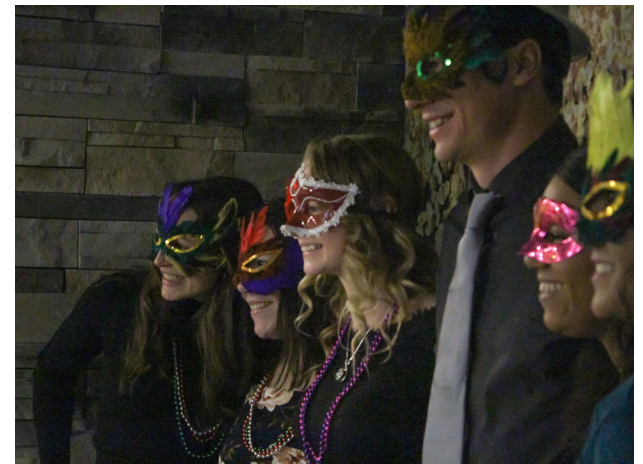
A group of party attendees smile for a photo during the student world language clubs Mardi Gras Masquerade Ball on Feb. 25 in Kilcawley Center.

“I wish there are more events like this, maybe a foreign film festival as well, where we have every club talking about a movie and explaining it and what it means to their culture and language studies,” she said.