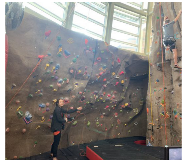
The Andrews Student Recreation and Wellness Center offers bouldering along with rock climbing.

Bouldering will be available in Mill Creek Park during regular park hours, while the rec center climbing wall is open 12-8 p.m. Monday through Friday.