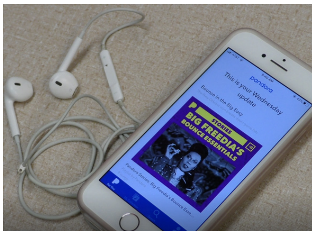
Buckeye Hospice and Palliative Care uses music therapy to help patients with dementia by playing their favorite songs through Pandora.

Music therapy benefits many Alzheimer's patients across the country. According to the Alzheimer's Association, music may reduce agitation and improve behavioral issues that are