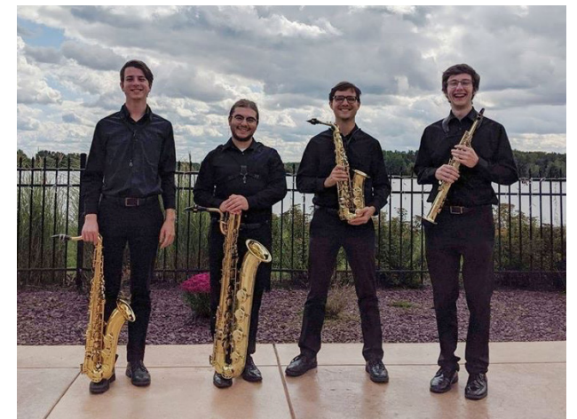
The Dana School of Music's Helix Saxophone Quartet was selected as a semifinalist for the North American Saxophone Alliance 2020 Biennial Conference in Tempe, Arizona on March 6-9.

The quartet members are looking forward to making their school, coach and themselves proud.