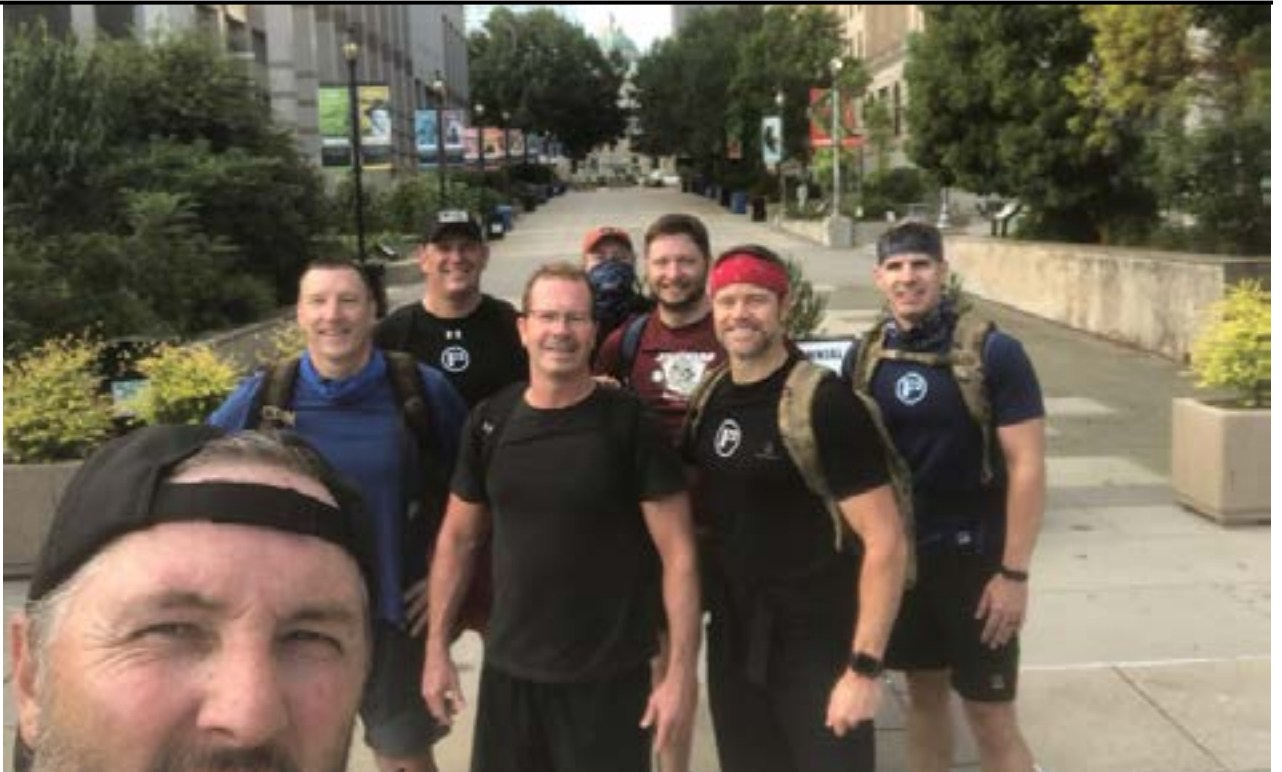
Fitness group, F3, meets in downtown Raleigh, North Carolina, to participate in 25 Push-Ups for 25 Days.

Many veterans, he said, come to the VA for primary care or mental health.