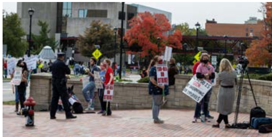
Students were instrumental in the faculty union’s strike efforts.