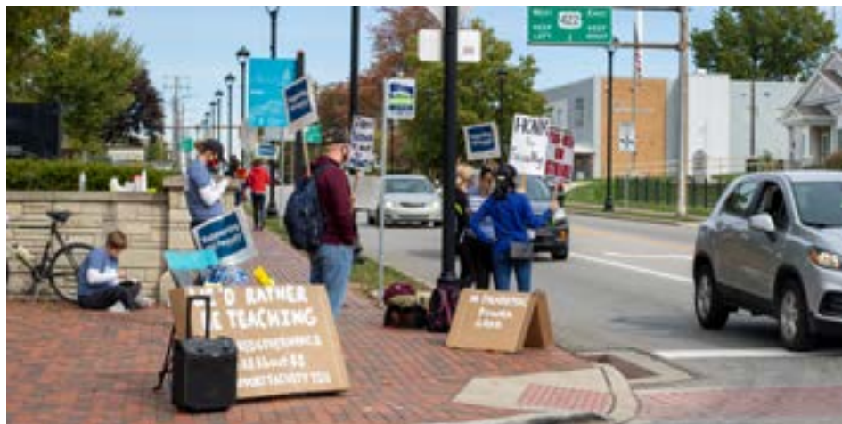
Faculty strike outside YSU President Jim Tressel’s home on Wick Avenue.

“Our hope remains that over these next two days we can get this settled,” he said. “But if we can’t and the strike spills into Wednesday when classes resume, we are working on a plan that we will have in place.”